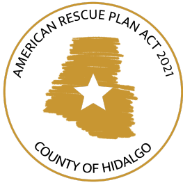
Exhibit A - Budget Amendments