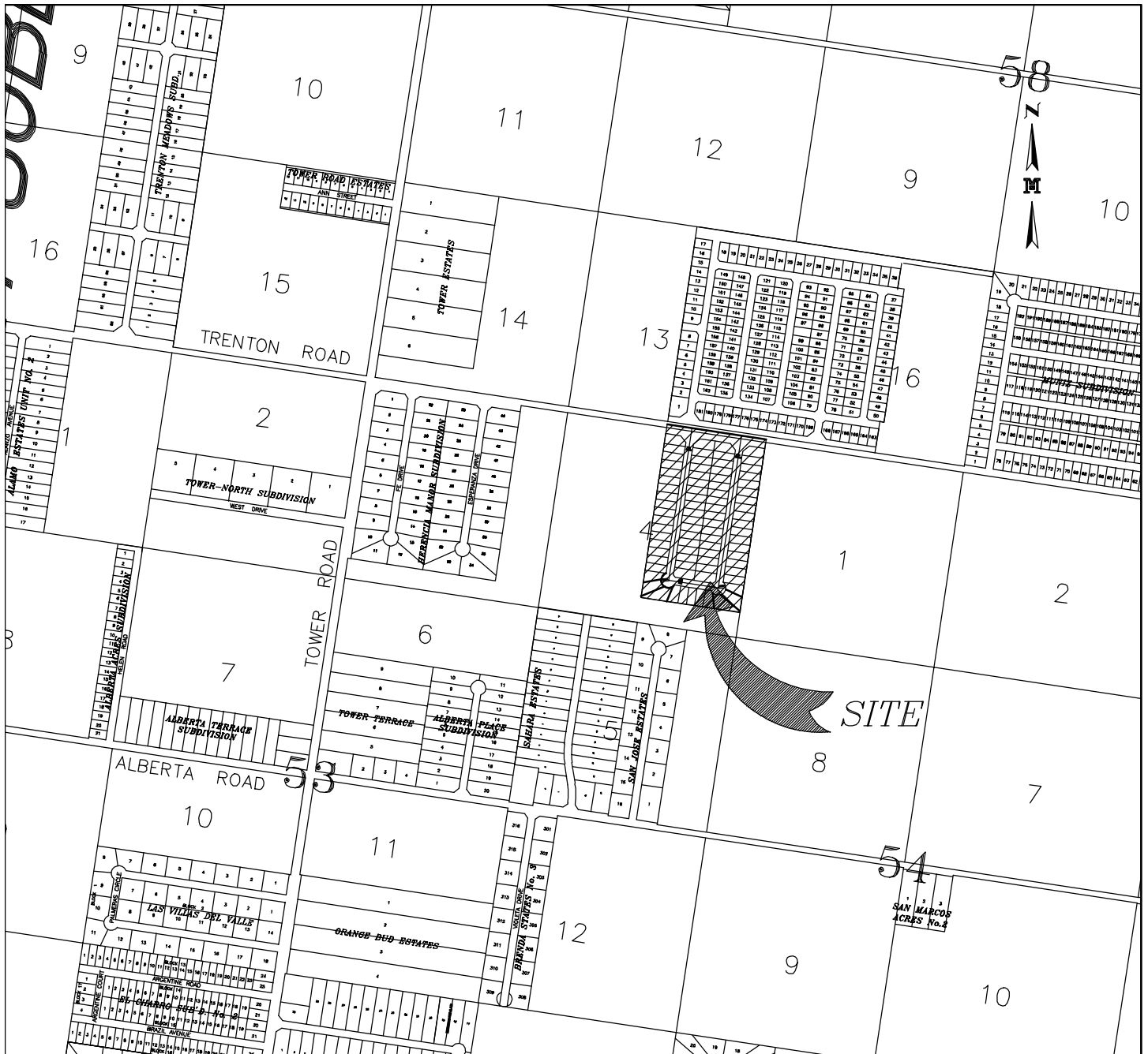
LOCATION MAP SCALE: 1" = 1000'