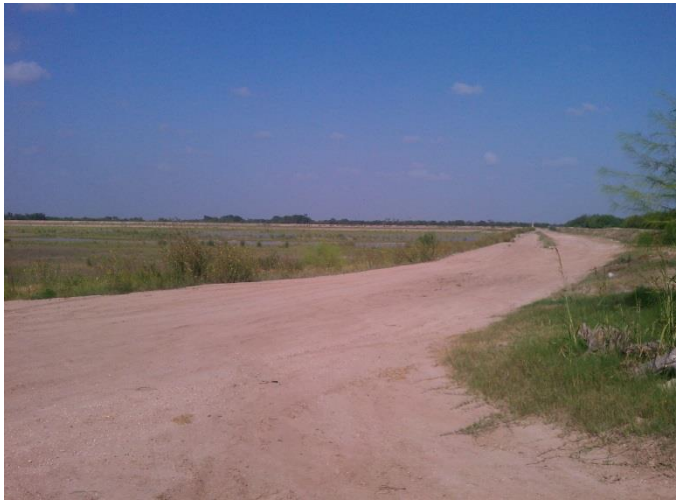
Photo 1 Eastern View of the Southern Boundary of Subject