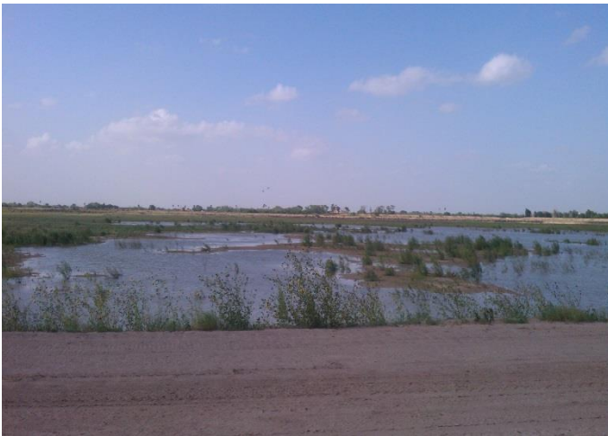
Photo 3 View of detention pond in use.

Looking: Photo 3: Northern View Photo 4: Northeastern View