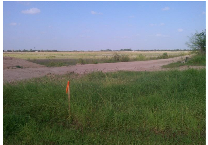
Photo 4 View of survey stake found at the southern boundary along Dillon Road.