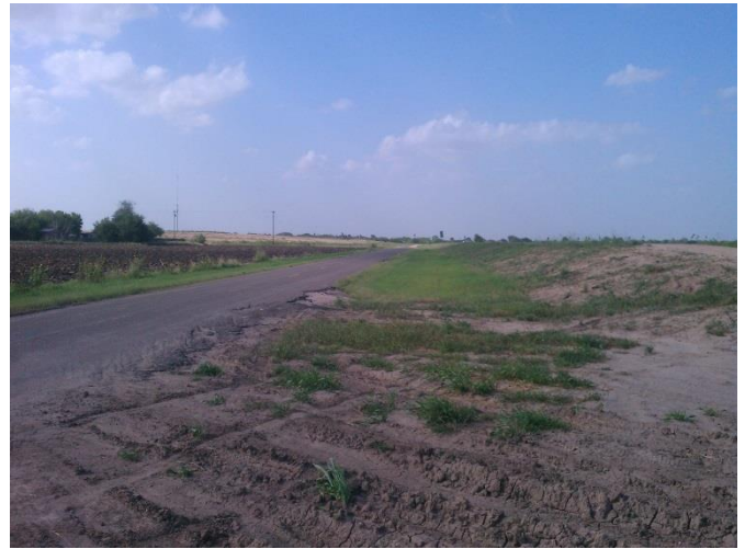
Photo 2 Northern View of Southern Boundary

Point which taken: Photo 3: Dillon Road Photo 4: Dillon Road