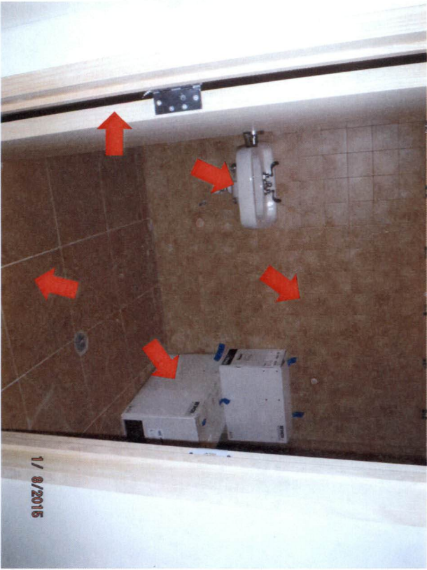
Floor & Wall tile, Plumbing fixtures installed.