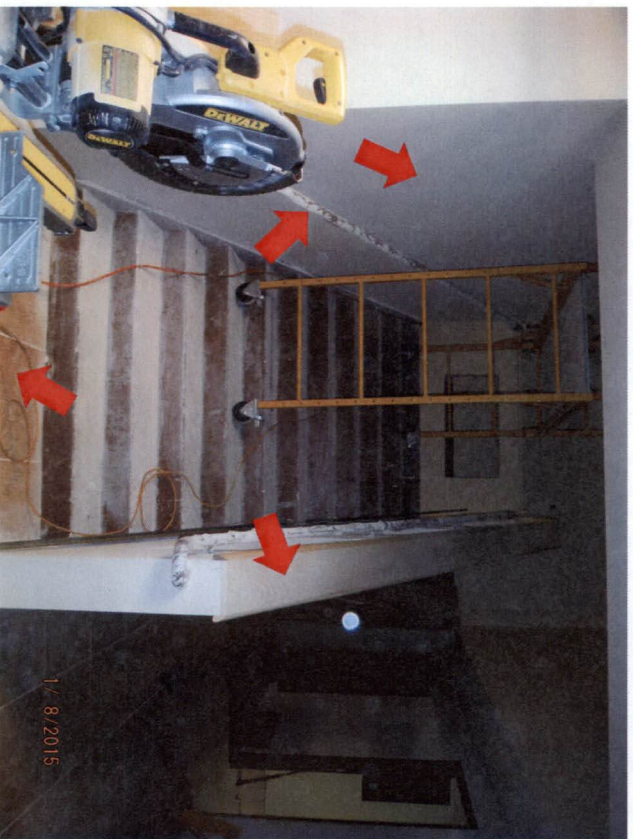
Stair rails, top wood part of railing wall & gypsum board underway, floor tile up to stair visor done.