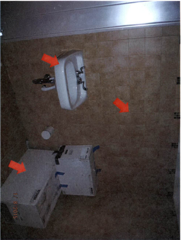
Plumbing fixtures, wall & floor tile work continues.