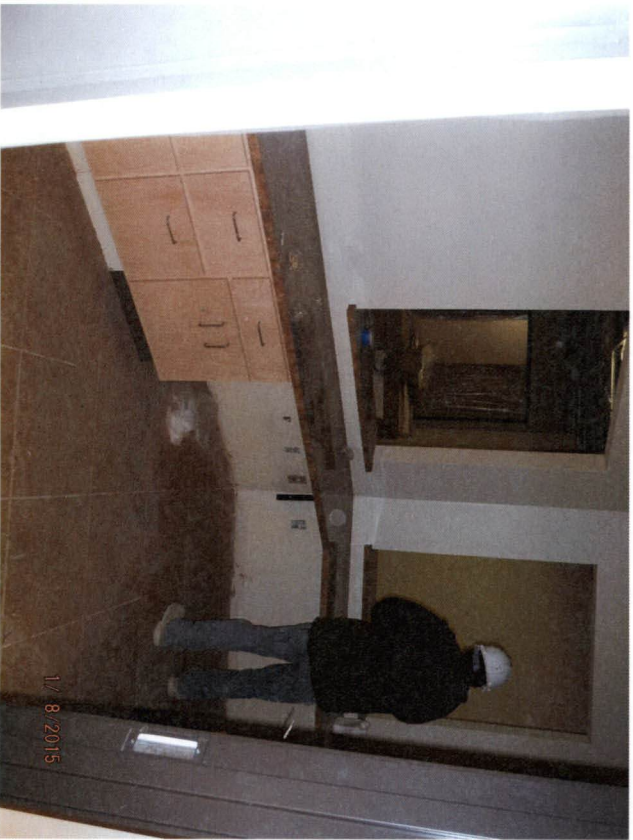
Counter tops, floor tile installed, painting underway.