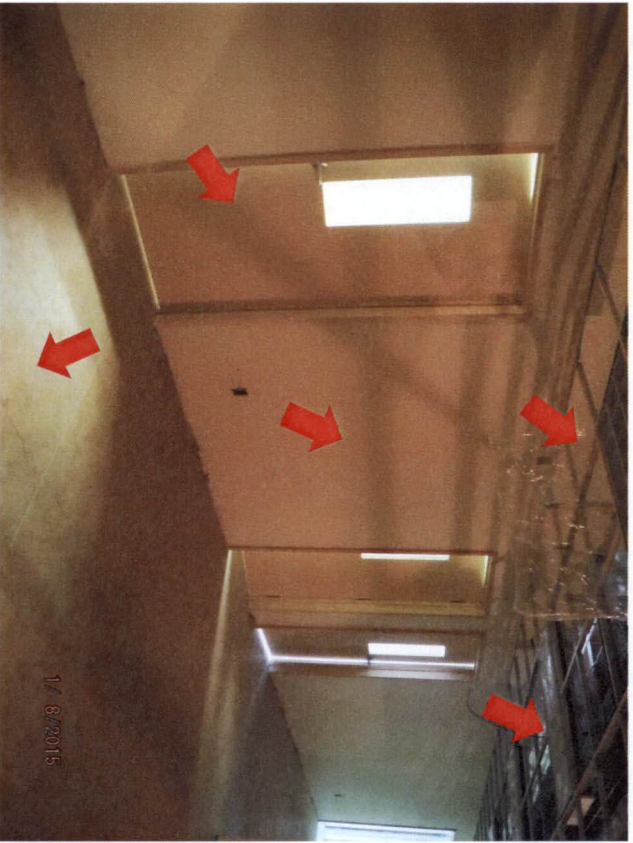
Floor tile, doors, ceiling track, light fixtures installed, partial painting.