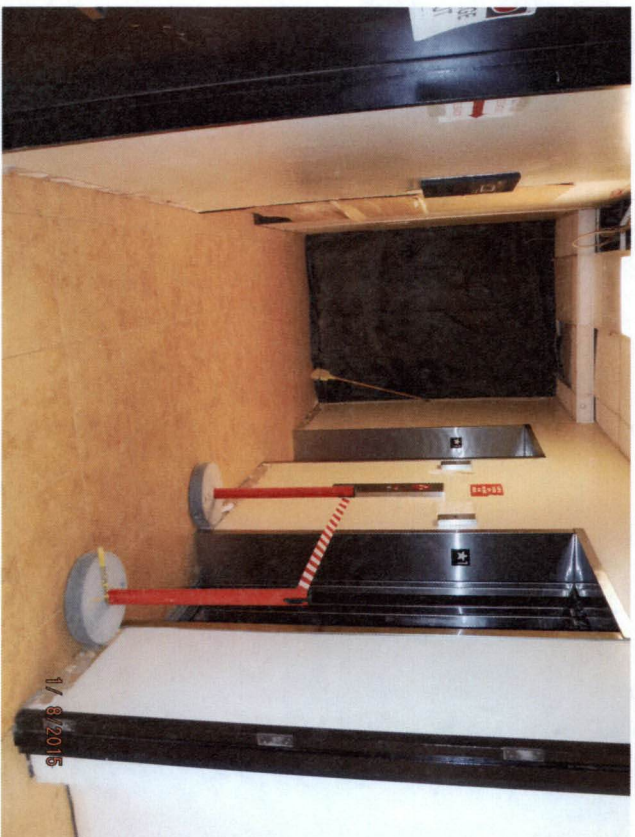
Floor tile work & electrical above ceiling underway.