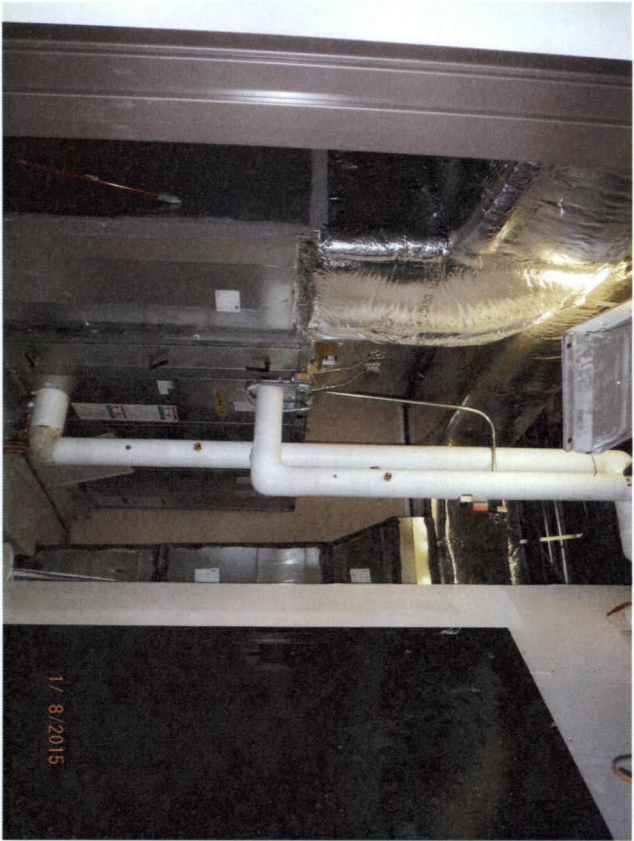
Mechanical & Electrical work at mechanical room.