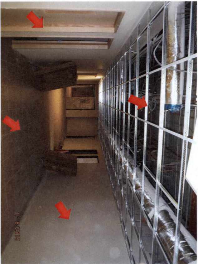
Ceiling track, floor tile, door frames & doors installed.