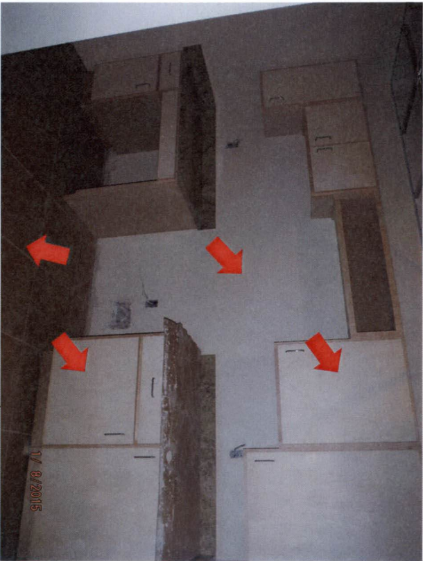
Floor tile & cabinets installed as well as ceiling track, walls partially painted.