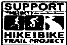
image002.jpg 3 KB