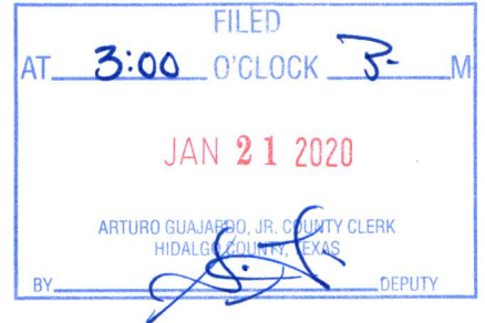
EXHIBIT E -Work Authorization