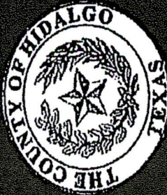
EXHIBIT "A" PURCHASING DEPARTMENT ASSET DISPOSITION FORM

Purpose of Form: This form is to be used for asset disposition only. (E.g., trade-in, destroyed, lost, stolen, obsolete, damaged beyond repair, etc.) Items listed on this form require County Commissioners approval.