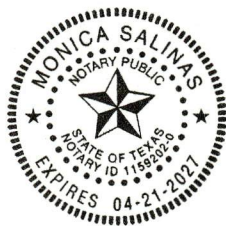
Notary Public For the State of Texas

SIGNED AND SWORN TO BEFORE ME, on the 12 th day of Nov. , 2024.