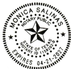
Notary Public For the State of Texas

SIGNED AND SWORN TO BEFORE ME, on the 17 th day of Dec. , 2024.