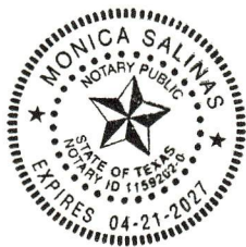
Notary Public For the State of Texas

SIGNED AND SWORN TO BEFORE ME, on the 7 th day of January , 2025.