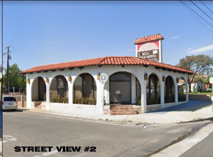
STREET VIEW #2