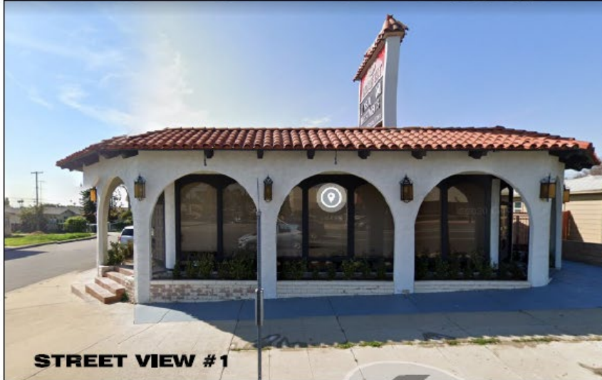
STREET VIEW #1