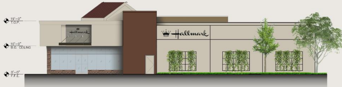
ELEVATION - C