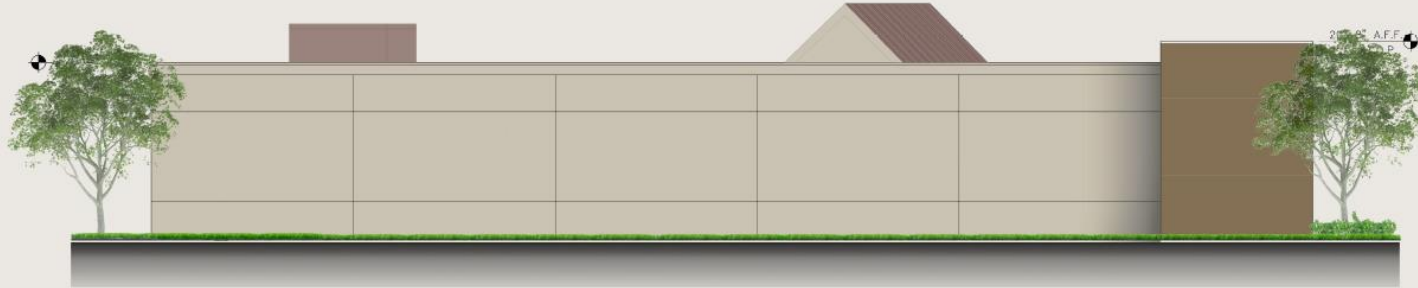
ELEVATION - D