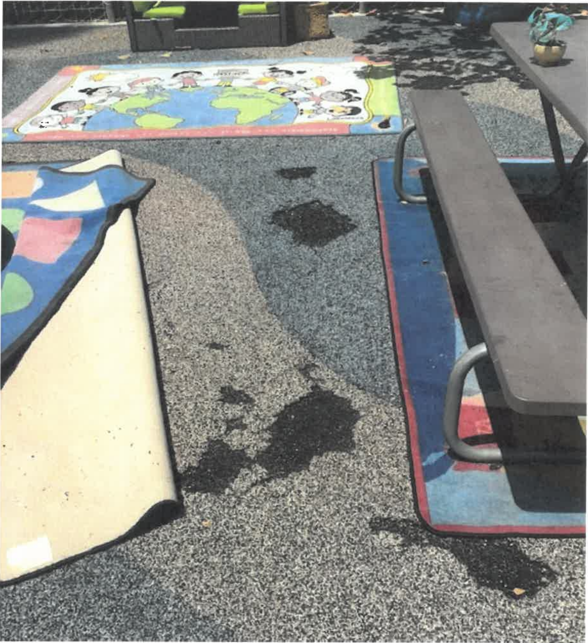
Sent from my iPad