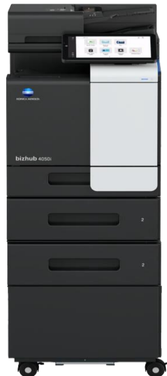
Floor Model Configuration