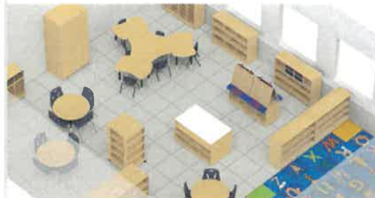
Elementary Classroom Package - Jonti-Craft