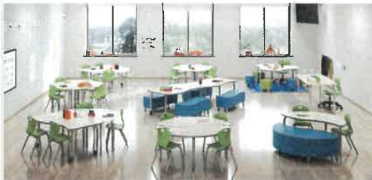
Scholar Craft Elementary Collaborative Classroom Package #2