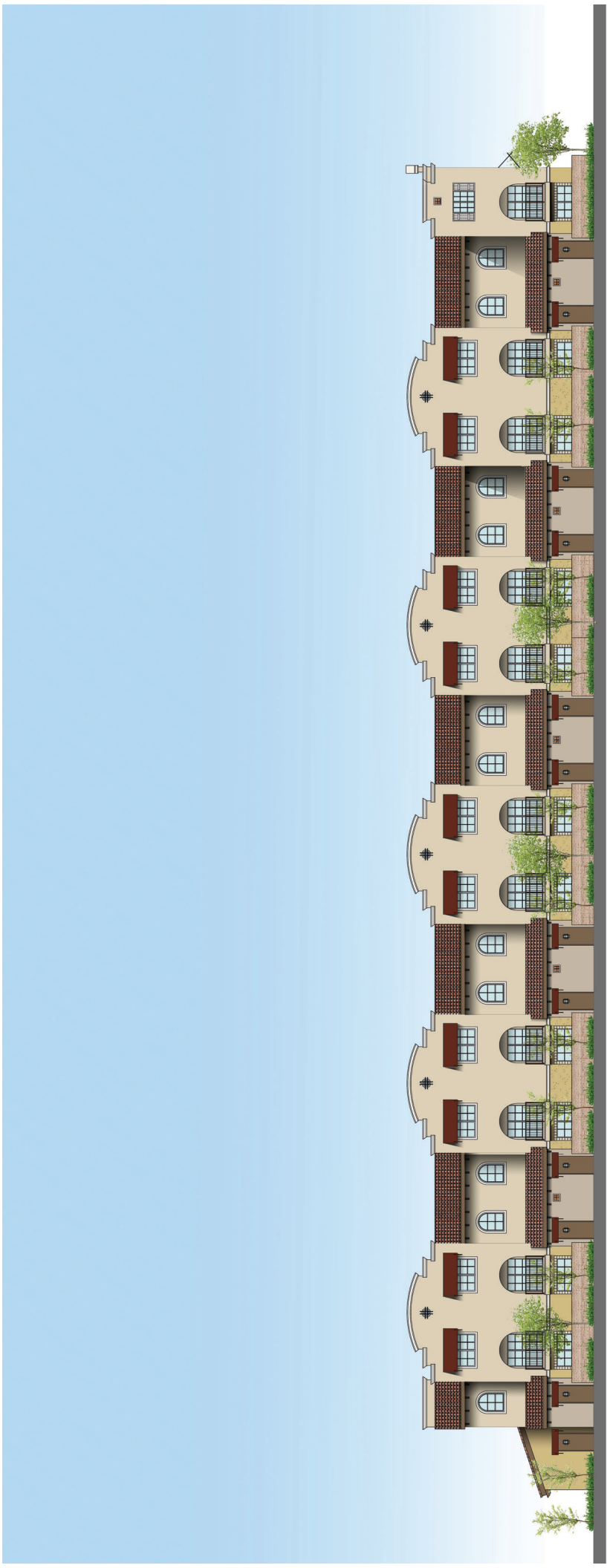
UNIT ENTRY ELEVATION