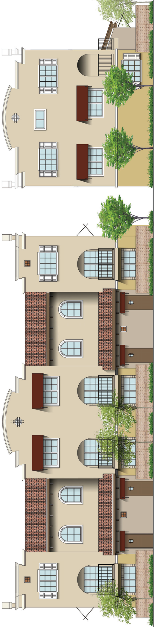
UNIT ENTRY ELEVATION