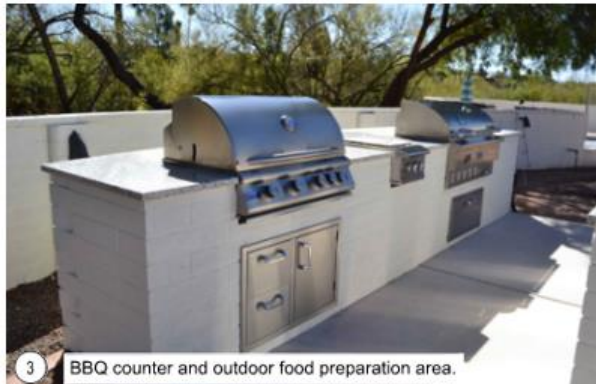
3 BBQ counter and outdoor food preparation area.