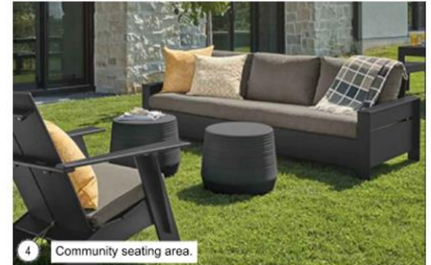
4 Community seating area.