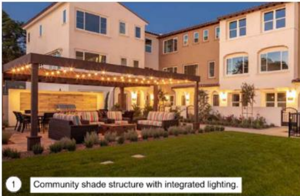
1 Community shade structure with integrated lighting.