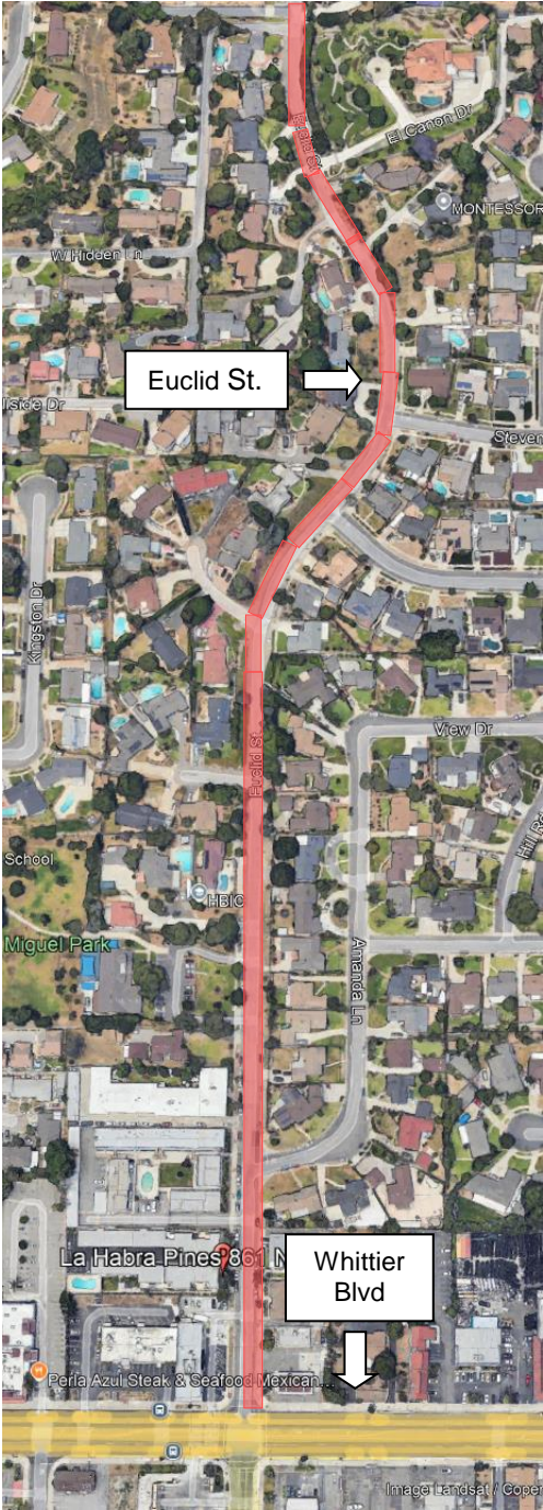
Location Map NTS

PROJECT NO. 1-R-21 Euclid Street Rehabilitation Project La Habra, CA