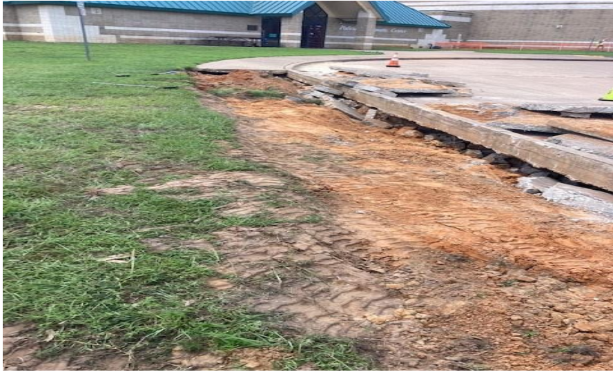
Second View Main Walkway