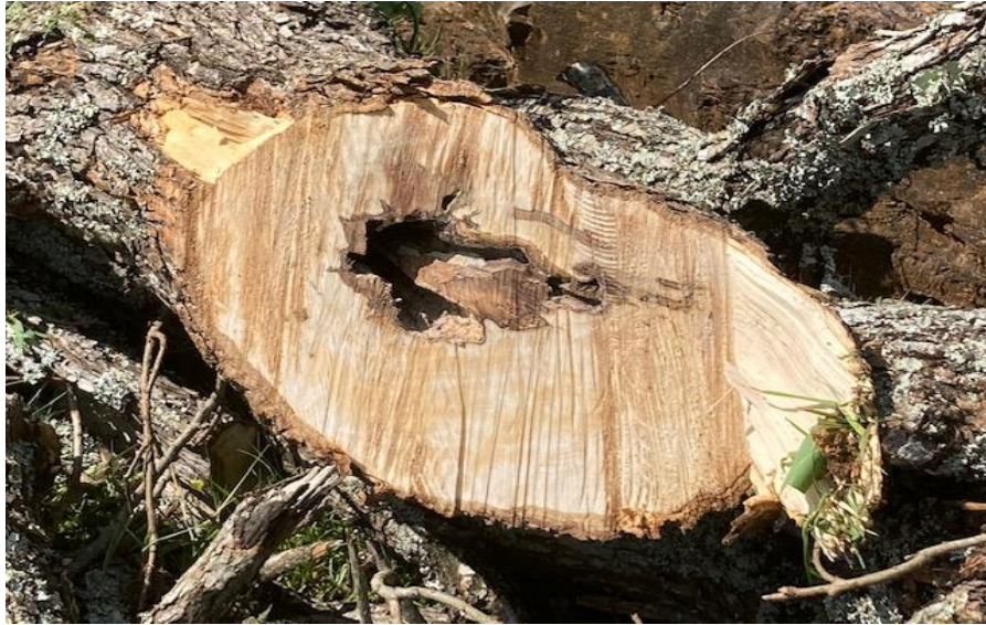
Floors Being Stripped City Hall