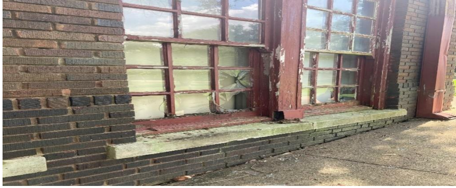
Hog Damage Calhoun Park