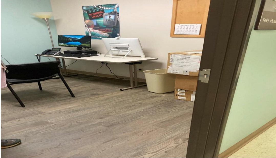
Add'l Floors VA Clinic