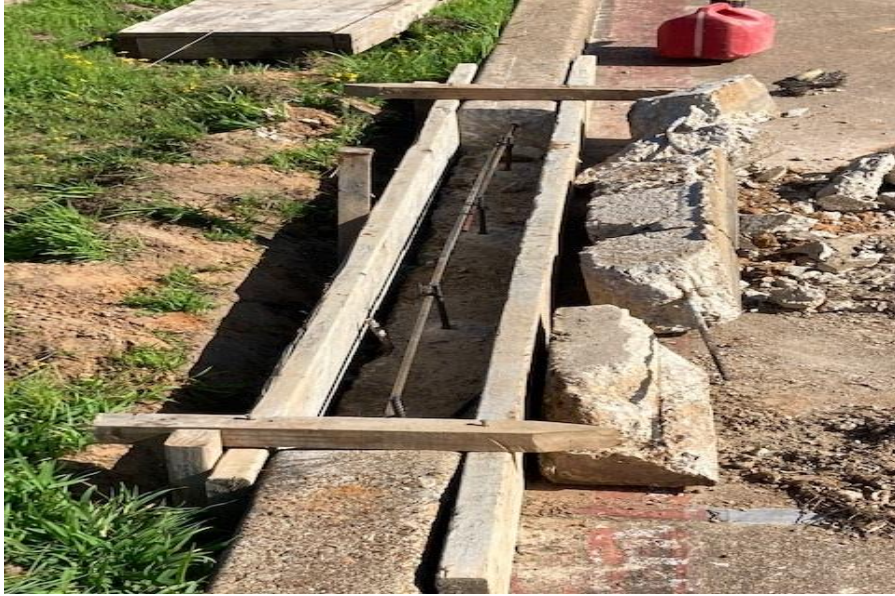
Rebar placement Main Walkway