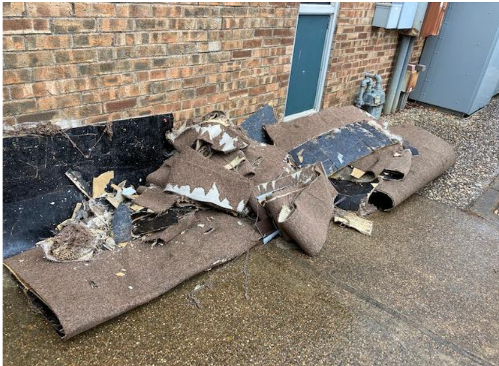
Floors After new Vinyl Put Down Asst HR