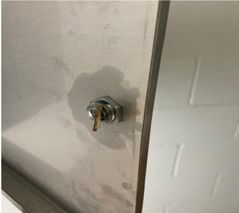
Bent Inside frame Paper Towel Dispenser