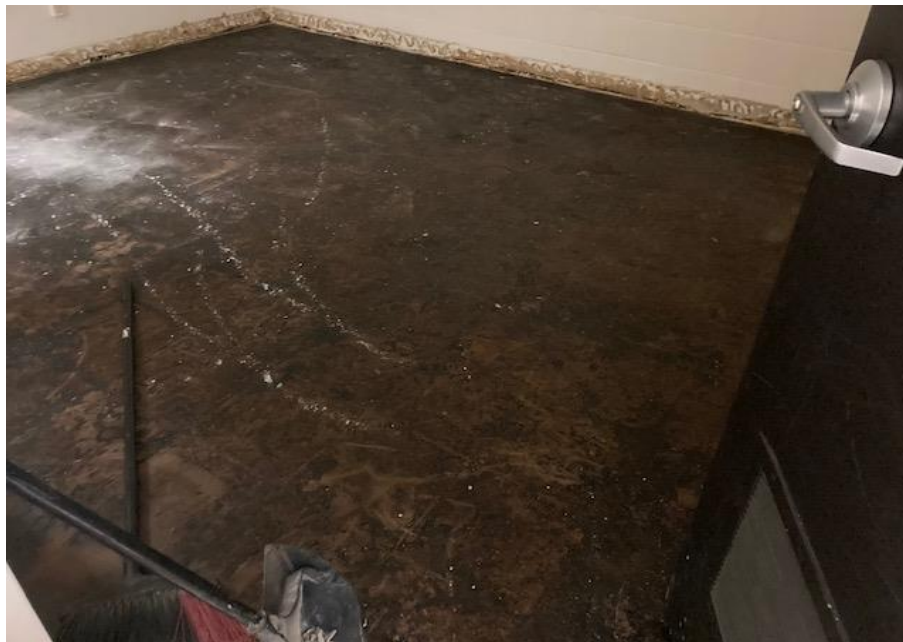
Floors City Hall