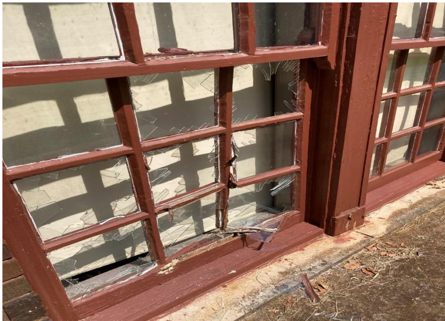
More Photos Museum