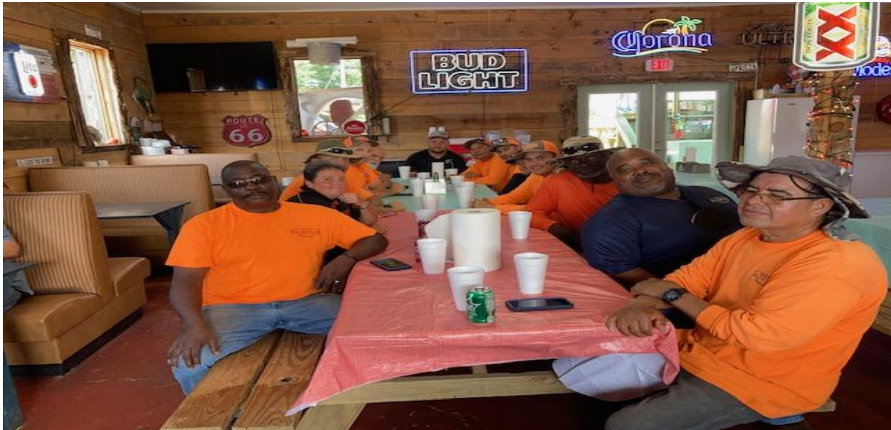
Broken Windows at Museums