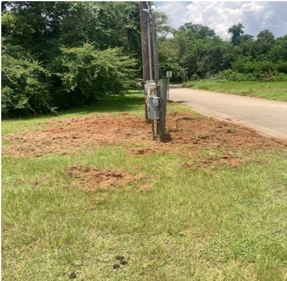
Second Photo Hog Damage Calhoun