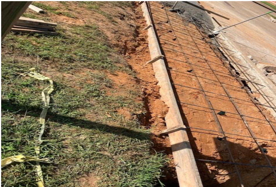
New Concrete Pour Main Walkway