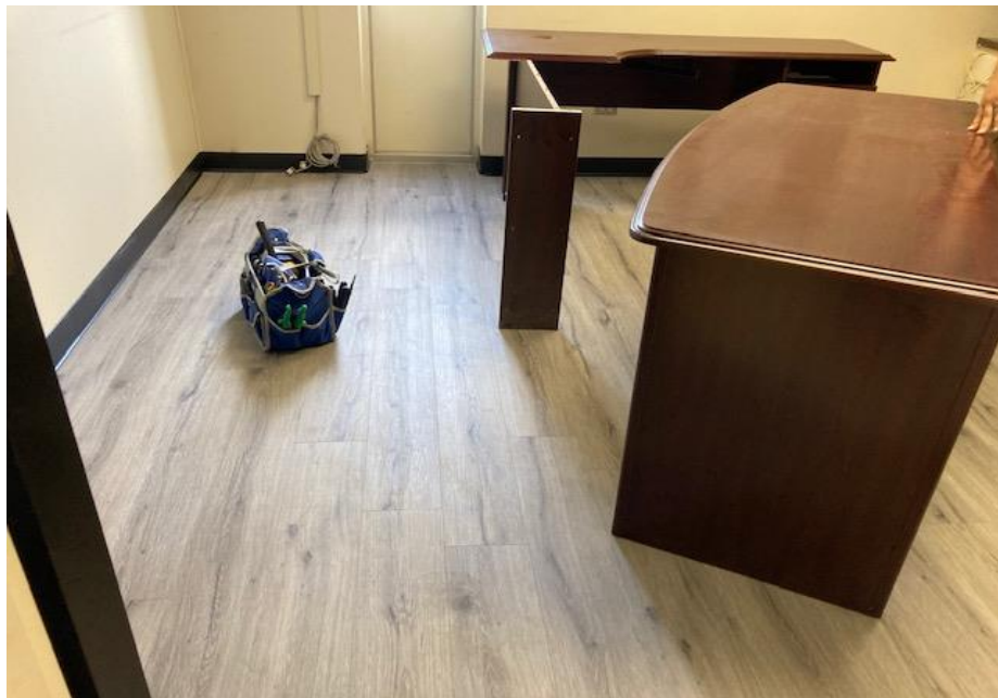
Floors VA Clinic