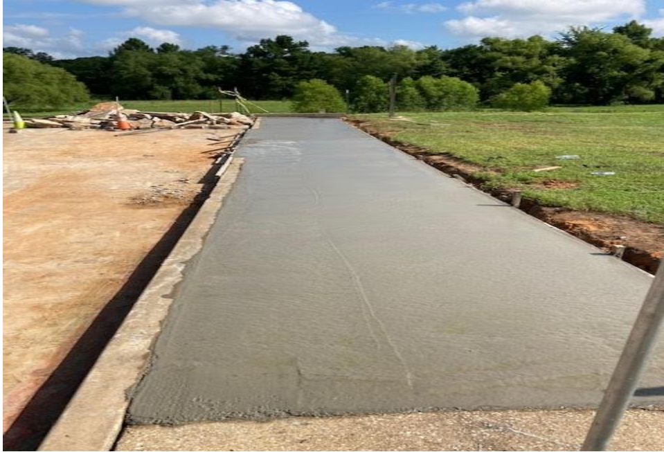
New Concrete by Front Gate