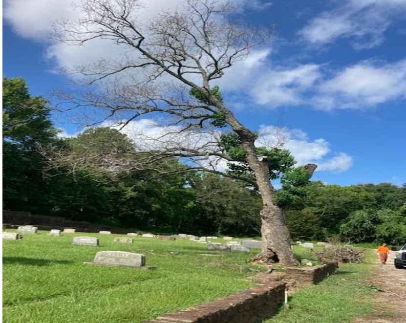
Addl. Picture 1 of 3 Tree's City Cemetery