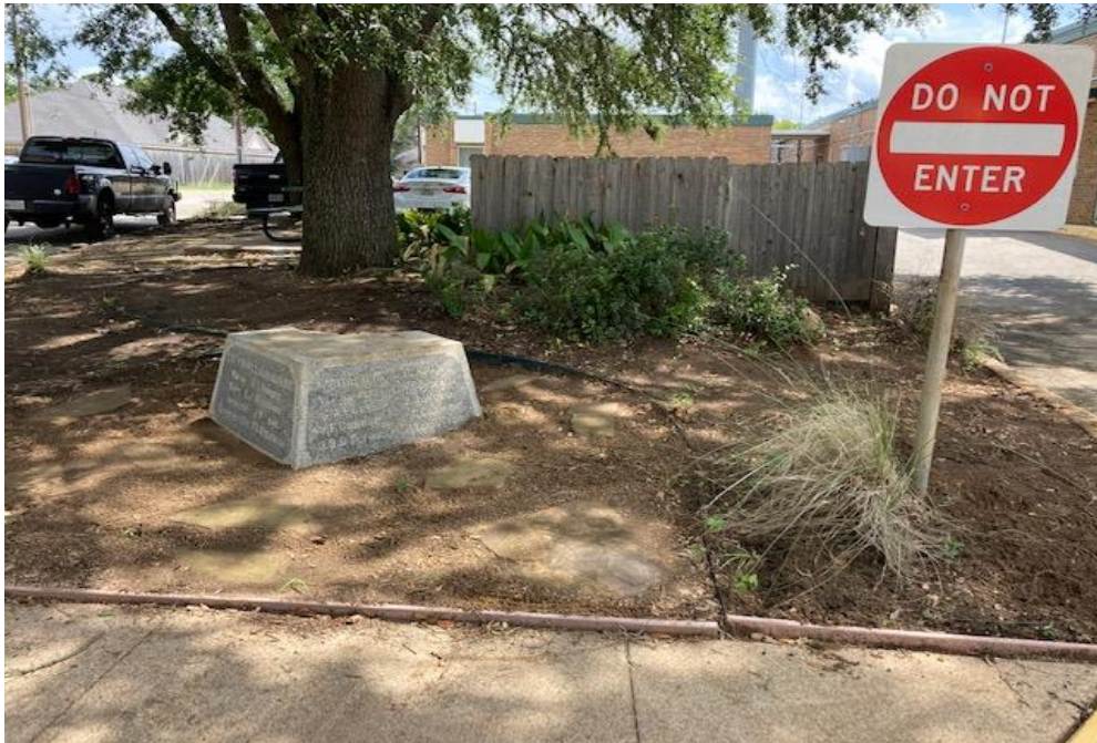
Flower Bed Behind City Hall After Cleaning #2