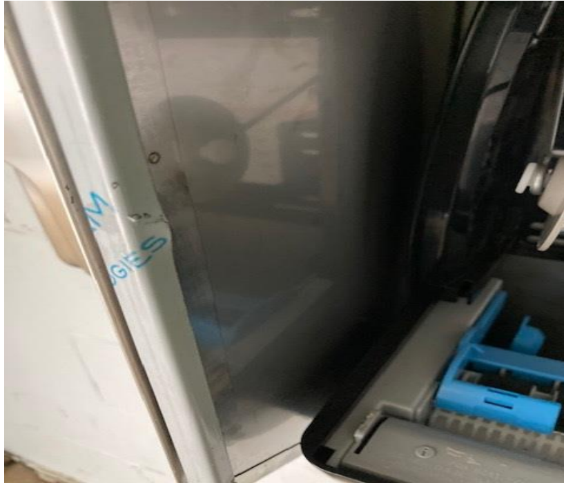
Damage to gate Pole Complex