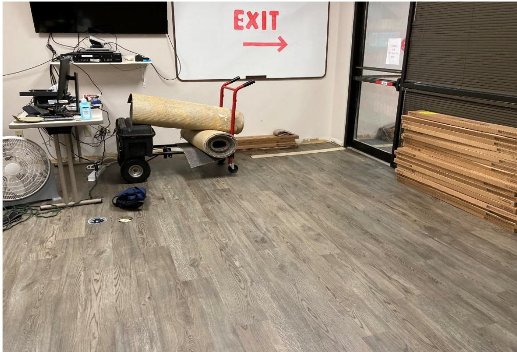
VA Floor Completion #4