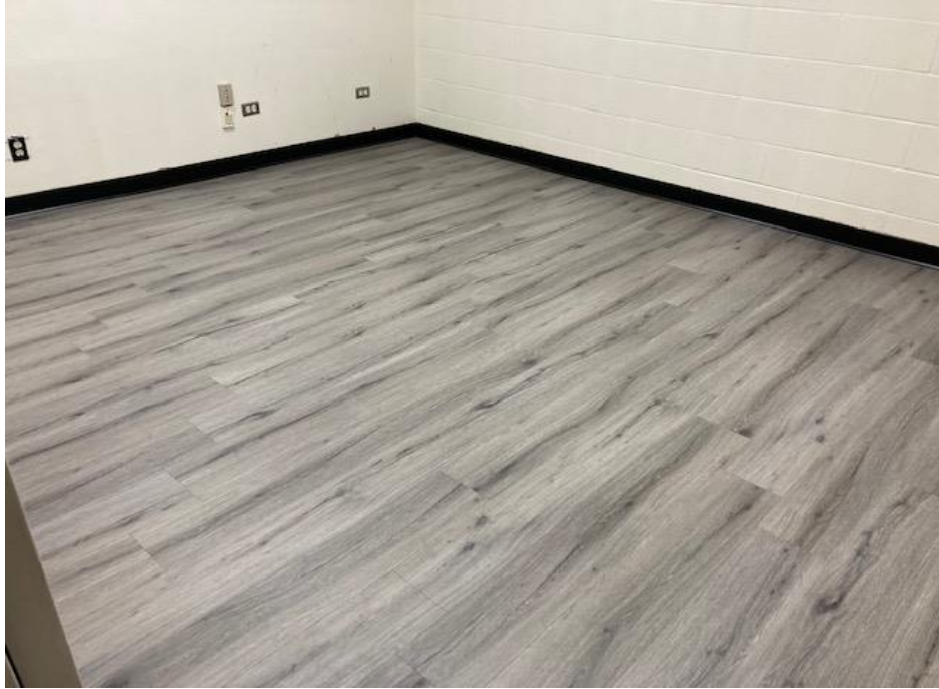
Development Services Office