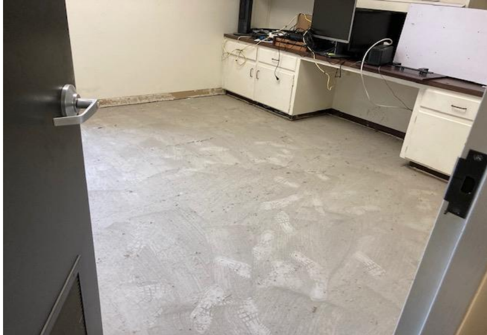
Carpet Removed City Hall