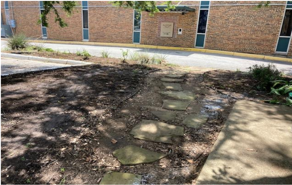
Flower Bed Behind City Hall After Clean #4