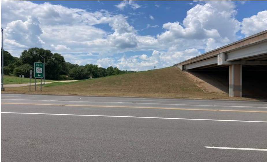
Hwy 155 Gateway After Mowed