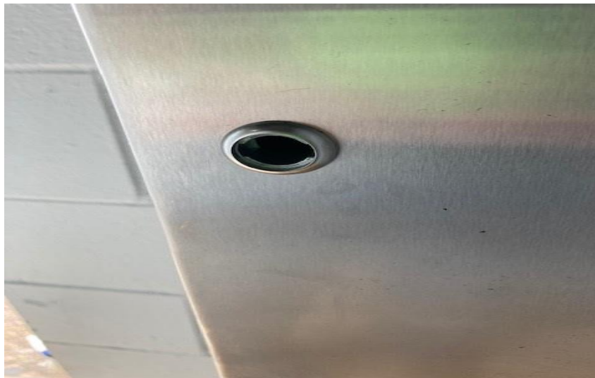
Bent Lock Paper Towel Dispenser Men's Farmers Market