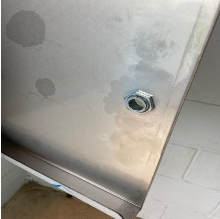
Broken Lock Paper Towel Dispenser