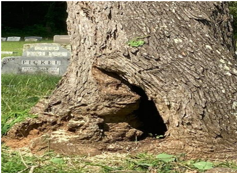
Rot going through 1 of 3 trees City Cemetery