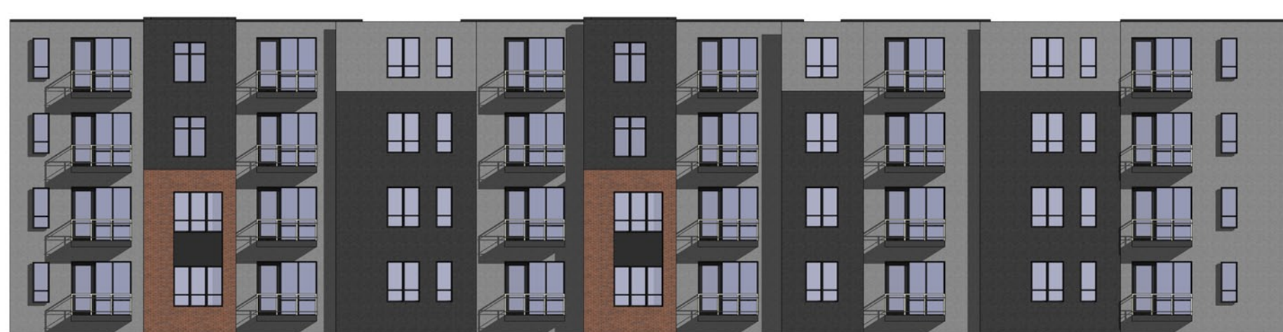
7 A301 COURTYARD SOUTH