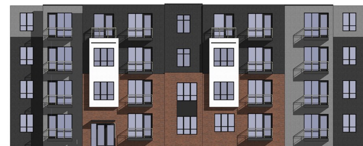
8 A301 COURTYARD EAST