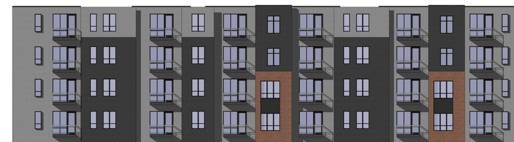
6 A301 COURTYARD NORTH