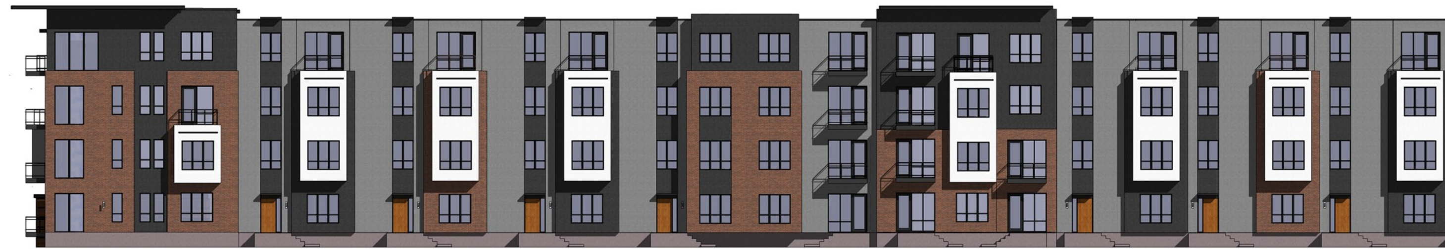
2 A301 ELEVATION FACING CIVIC CENTER DRIVE