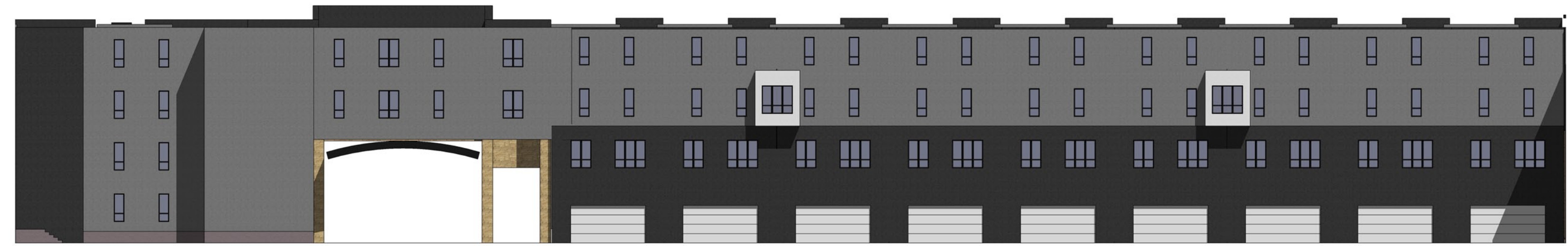
3 A301 ALLEY FACING PARKING RAMP