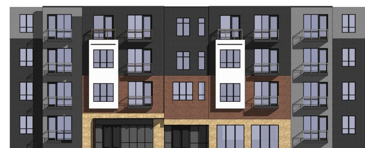
5 A301 COURTYARD WEST