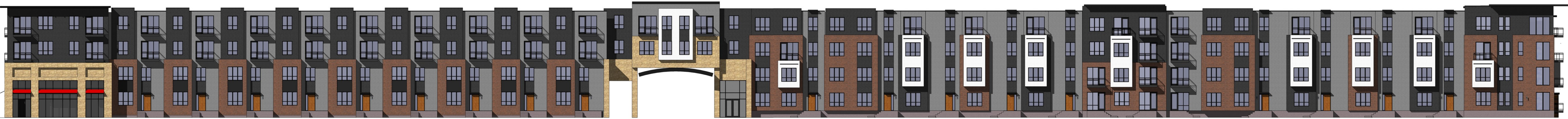
4 A301 ELEVATION FACING SUNWOOD DRIVE