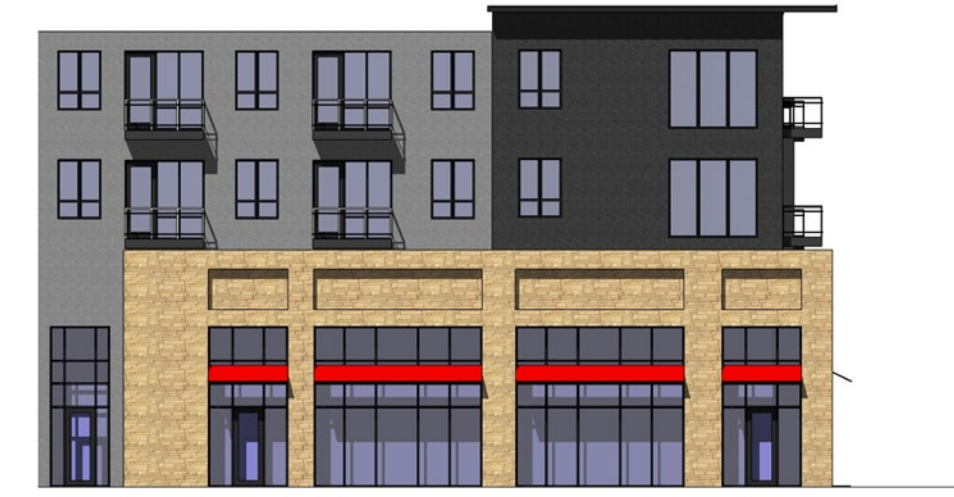
1 A301 RETAIL FACING CITY HALL