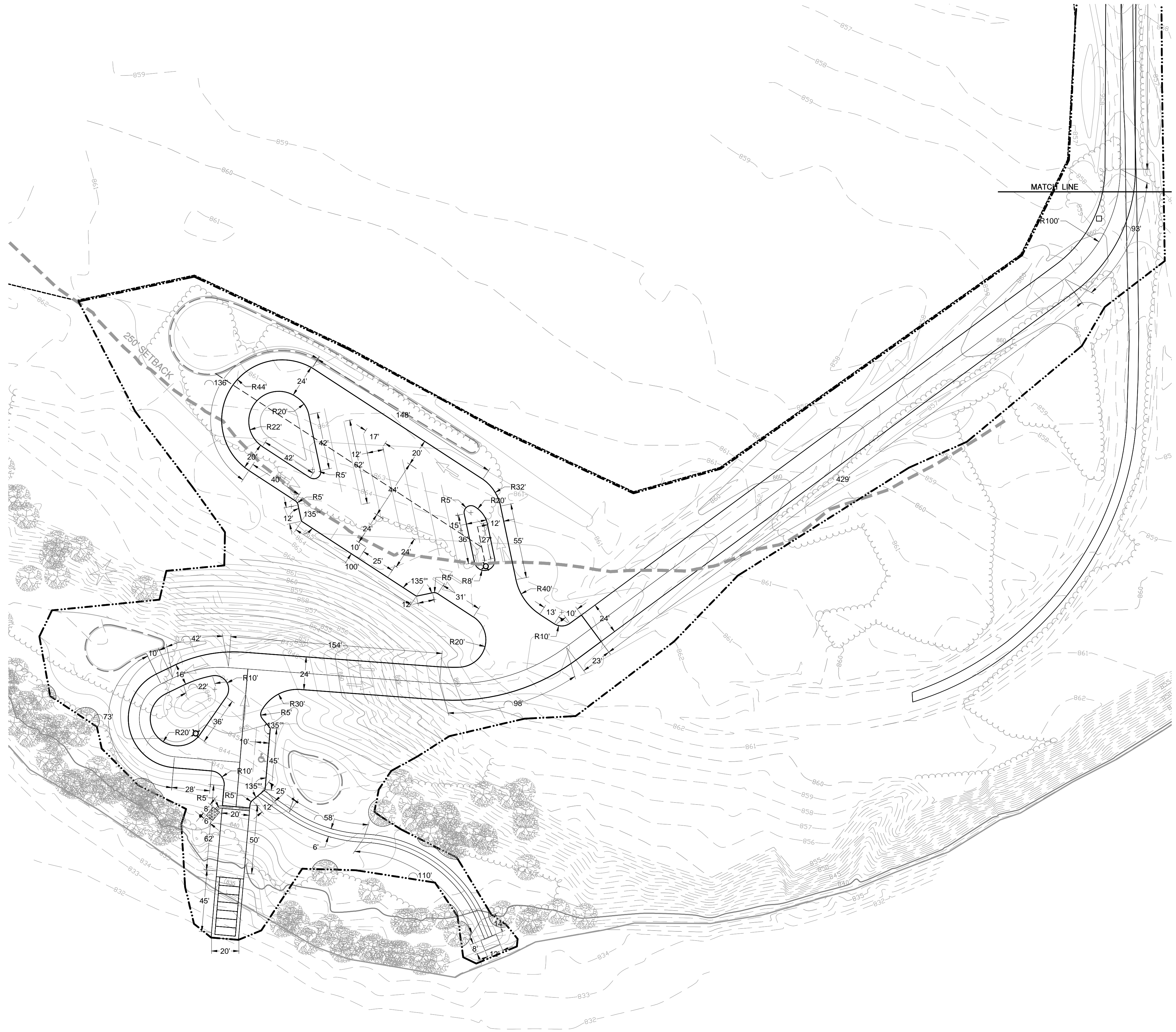
DIMENSION PLAN 0 40 80