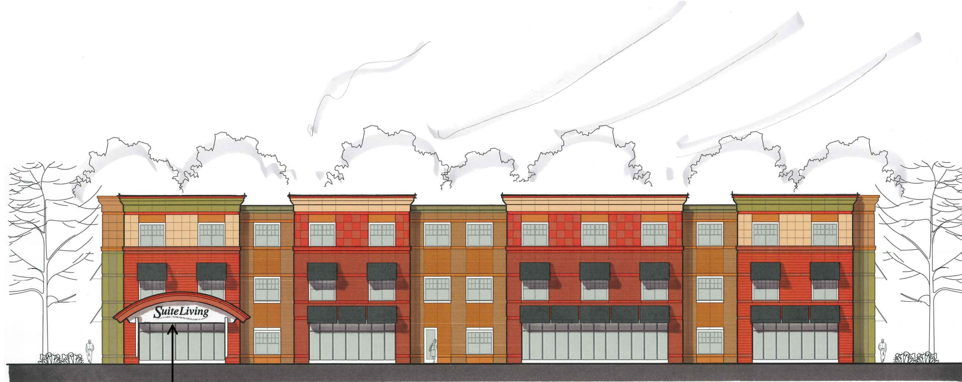
Proposed Back Elevation