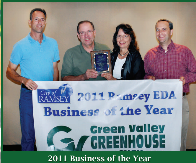
2011 Business of the Year