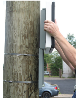
Universal mounting bracket

Folding Sign Plate: Sign is available with smaller "Your Speed" sign plate that folds compactly for convenient relocation.