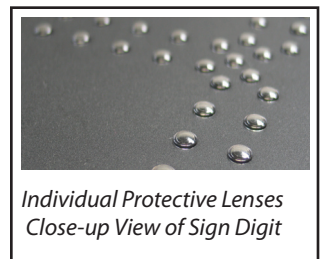
Individual Protective Lenses Close-up View of Sign Digit