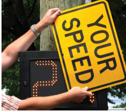
Folding Sign Plate

Battery Power: Lithium ion batteries offers extended operation with choice of 9.6V, 10Ah battery for two week performance or 12.8V, 15Ah battery for four week performance before recharge under normal operating conditions.