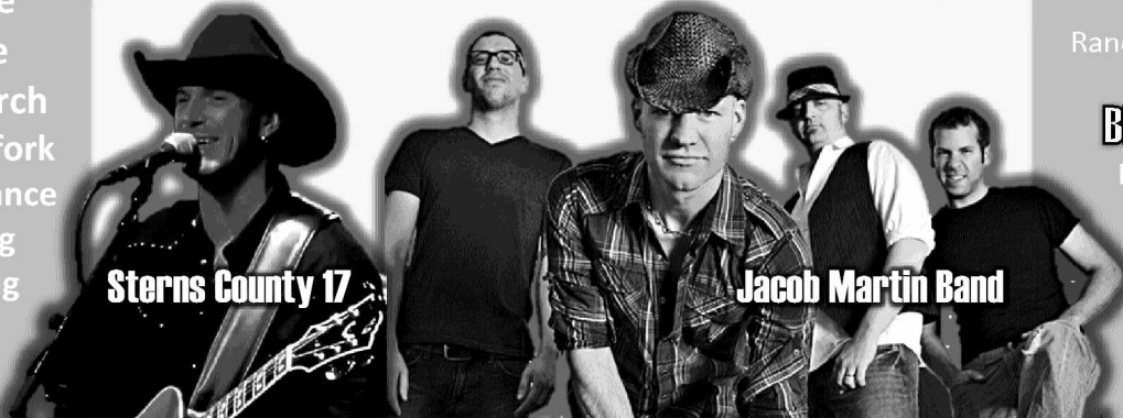
Sterns County 17