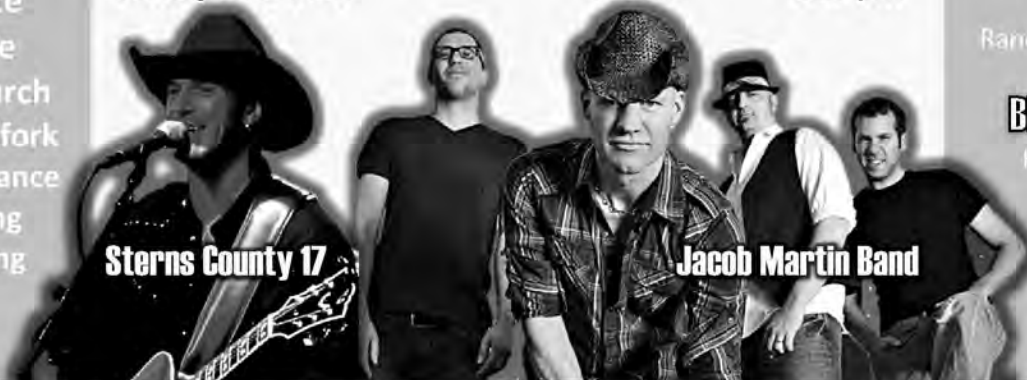
Sterns County 17