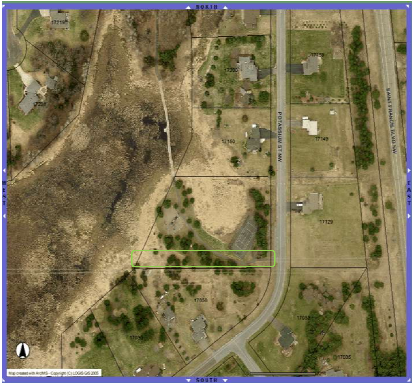
Area of trees cleared within park