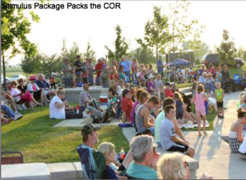
Stimulus Package Packs the COR