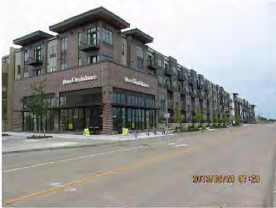
Photo taken June 20, 2013 along Sunwood Drive at the Municipal Center looking west.

Below are recent project photos. [Updated June 20, 2013]