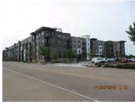
Photo taken along Sunwood Drive at the west end of the project looking east.