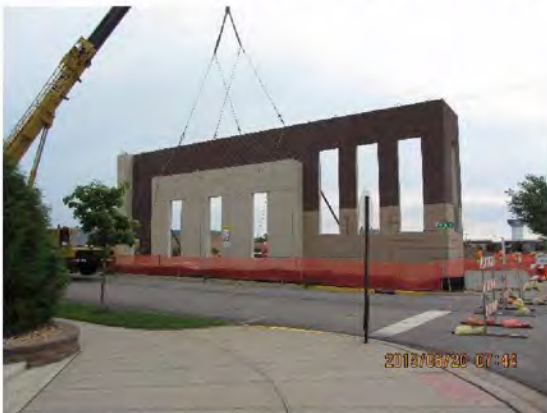
Photo taken June 20, 2013 at Sunwood Drive and Peridot Street looking north east.

Below are recent project photos. [Updated June 20, 2013]