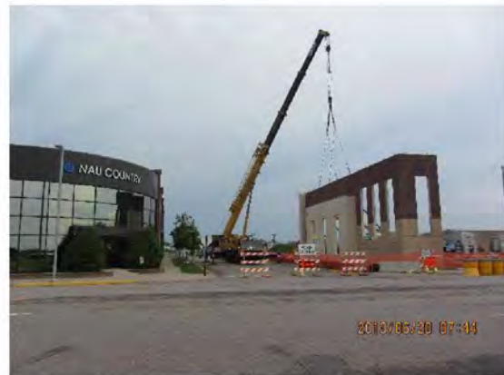
Photo taken June 20, 2013 at Sunwood Drive and Peridot Street looking north east.