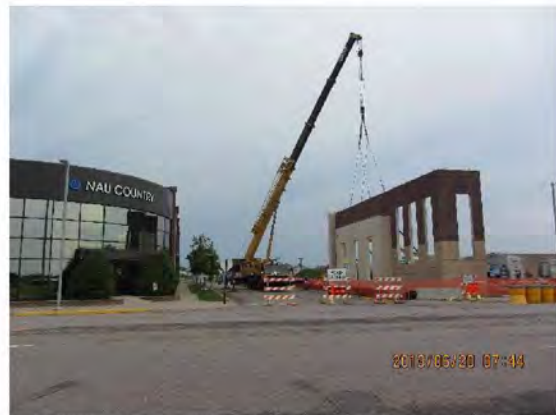
Photo taken June 20, 2013 at Sunwood Drive and Peridot Street looking north east.