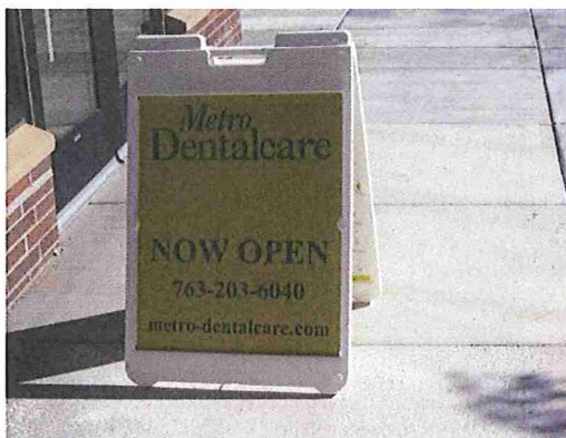
Photo taken the Municipal Center Plaza in front of the retail space.