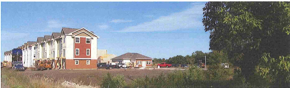
Photo taken on August 22, 2013 on the north side of Bunker Lake Boulevard looking west.