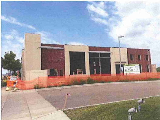
Photo taken August 1, 2013 at Sunwood Drive and Peridot Street looking north west.

Below are recent project photos. [Updated August 1, 2013]