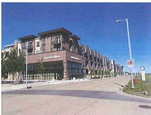
Photo taken June 27, 2013 along Sunwood Drive at the Municipal Center looking west.

A total of four (4) Temporary Certificates of Occupancy have been issued for a total of fifty-nine (59) and a portion of the office/common area. [Updated July 18, 2013]