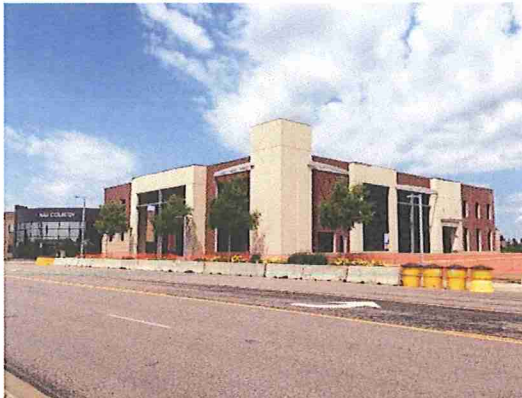
Photo taken August 1, 2013 at Sunwood Drive and Peridot Street looking north west.