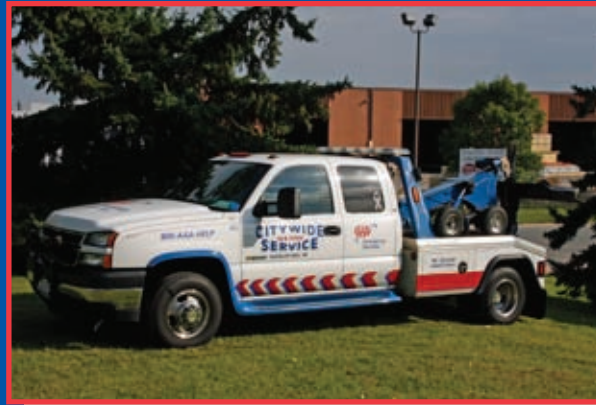
2007 Sterling Acterra Heavy Duty Tandem Axle Tow Truck GVW 52,000 lbs. Minnesota License # YBC6764