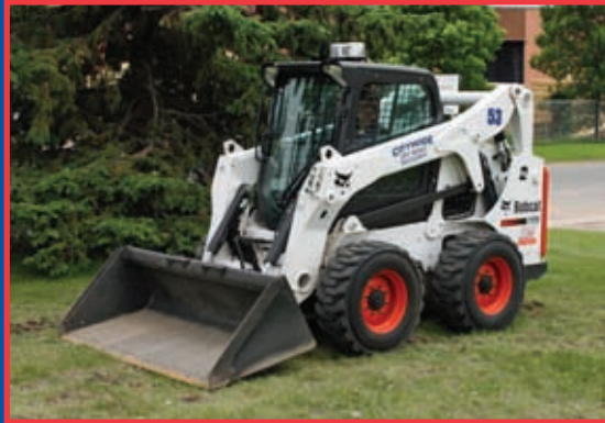
2012 Bobcat S650 Skid Steer Loader