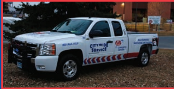
2011 International 4300 Car Carrier Flatbed GVW 26,000 lbs. Minnesota License # YBD1787