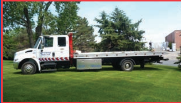
2015 Peterbilt 348 Heavy Duty Car/Truck/Cargo Carrier Flatbed GVW 71,000 lbs. Minnesota License # YBM8362