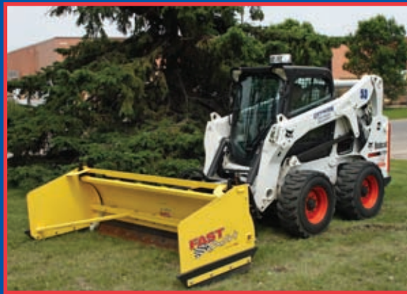
2012 Bobcat S650 Skid Loader with Snow Wolf 96" Blade