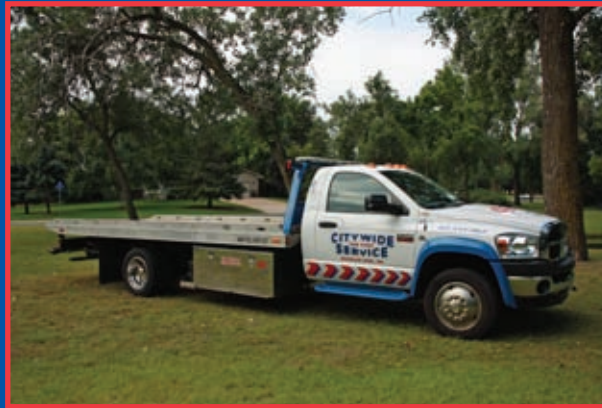
2008 Dodge 5500 4x4 Car Carrier Flatbed GVW 21,000 lbs. Minnesota License # YAZ5132