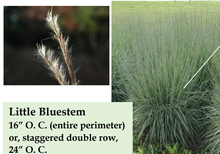
Little Bluestem 16" O. C. (entire perimeter) or, staggered double row, 24" O. C.