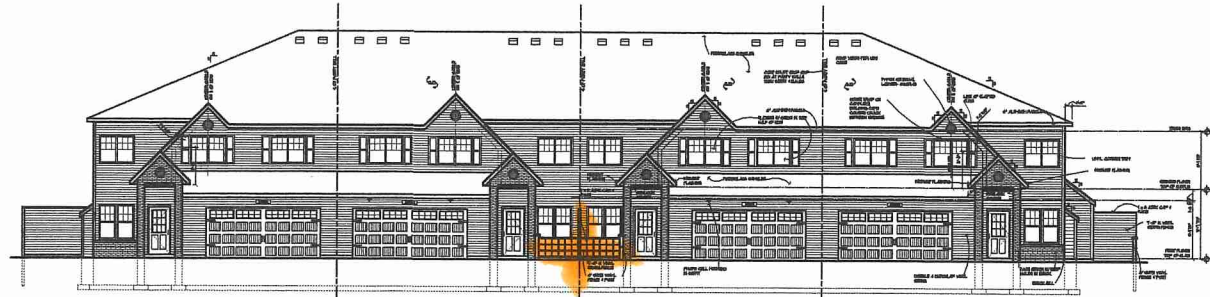
① OVERALL FRONT ELEVATION SCALE: 1/8"=1'-0"