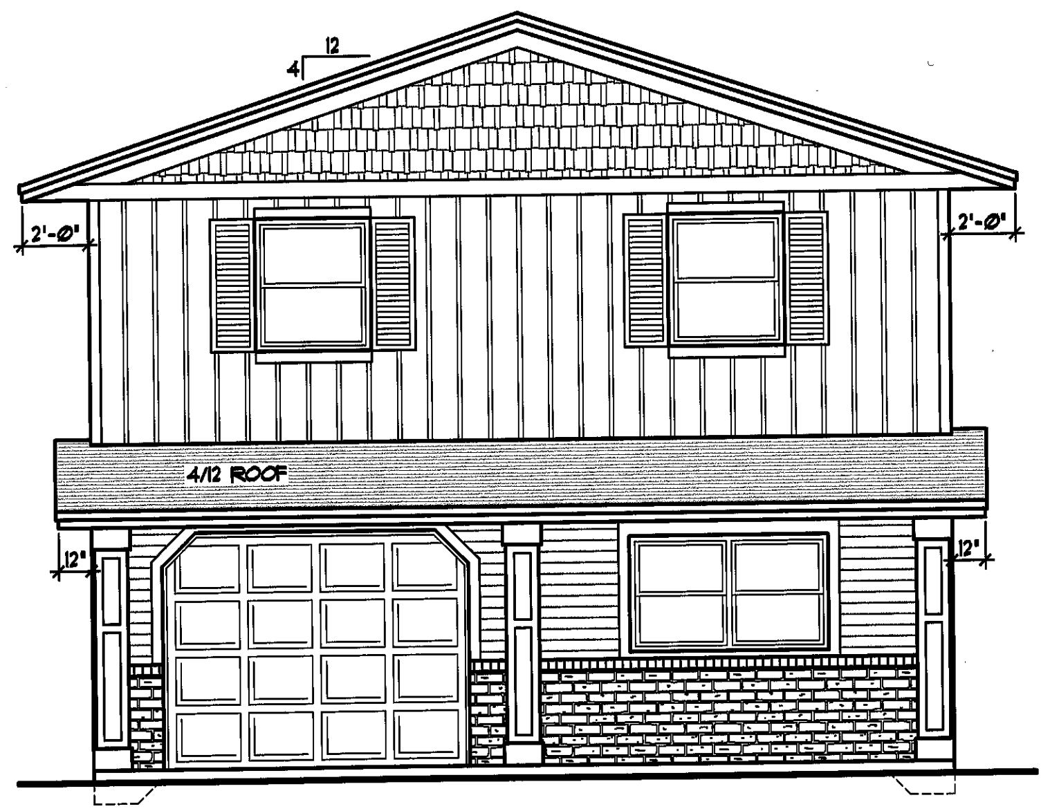
FRONT ELEVATION 1/4"=1'-0"