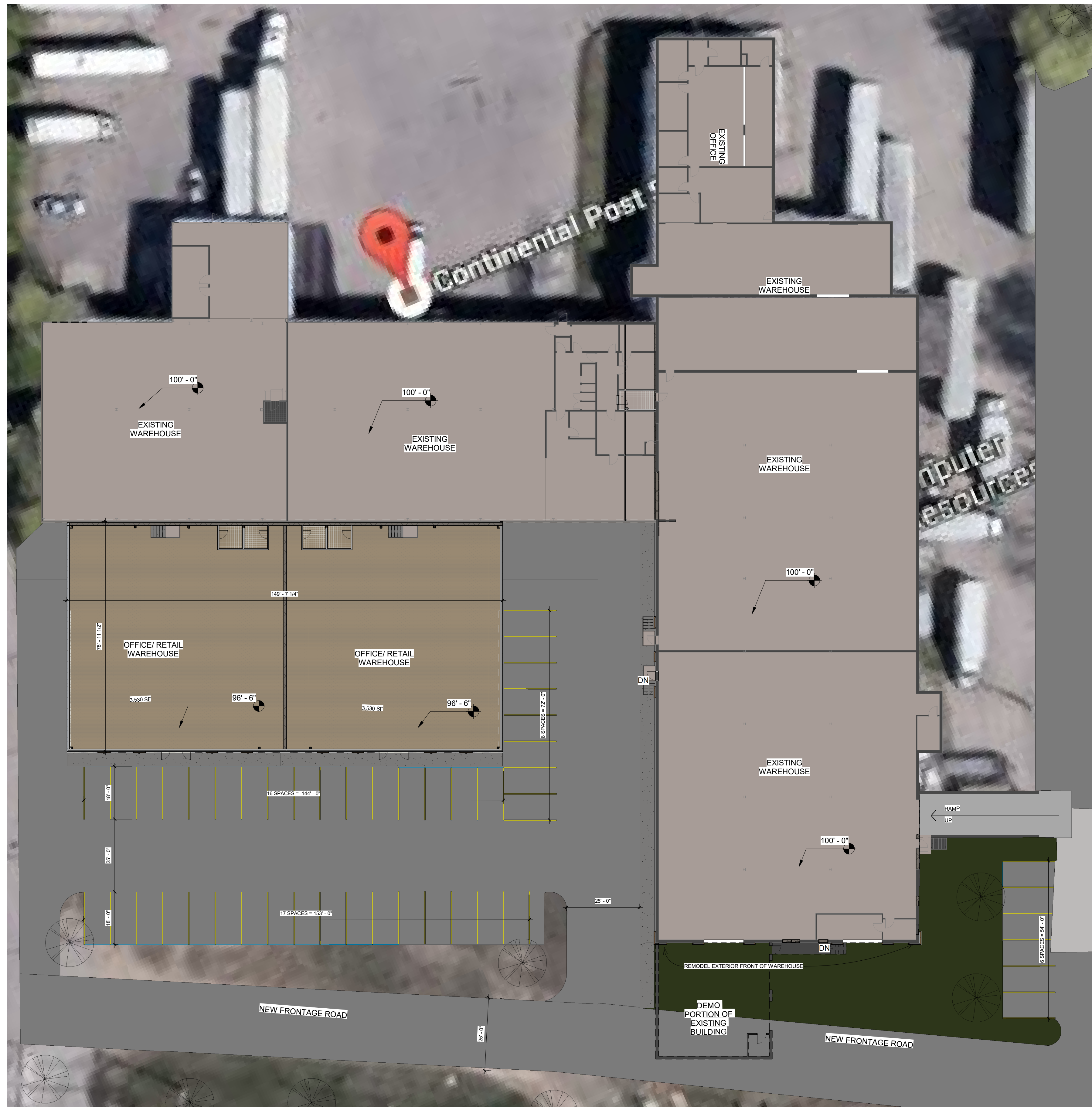
1 Site Plan- Long Term Growth Plan- Warehouse 1" = 20'-0"