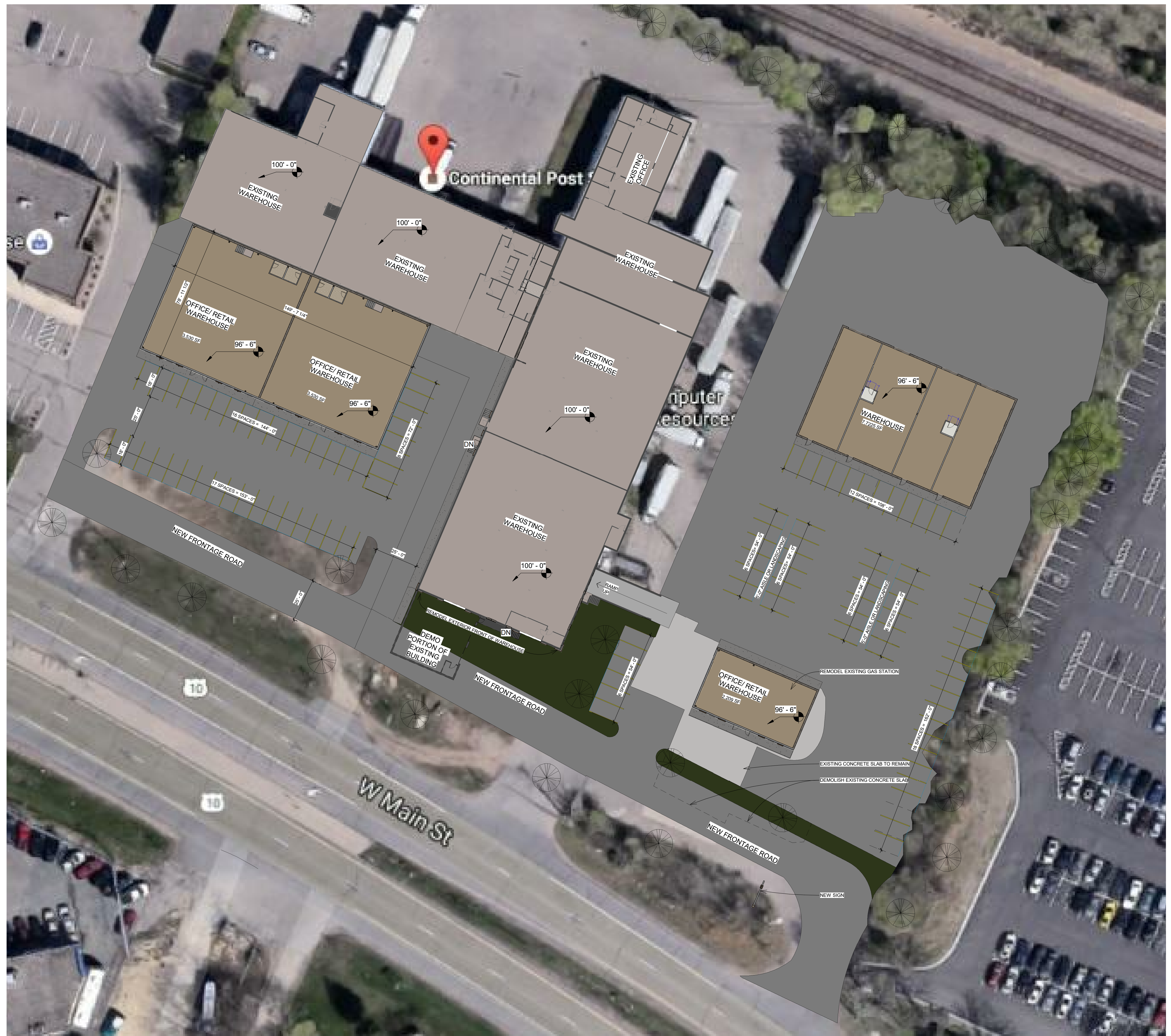
① Site Plan- Long Term Growth Plan 1 to 30 1" = 30'-0"