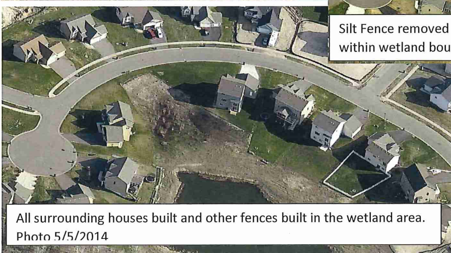
All surrounding houses built and other fences built in the wetland area. Photo 5/5/2014