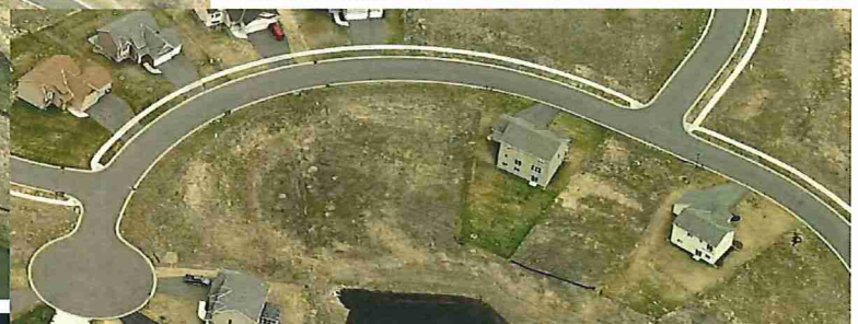
Silt Fence removed as of 4/19/2011 and yards established within wetland boundary