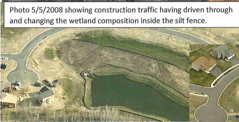
Photo 5/5/2008 showing construction traffic having driven through and changing the wetland composition inside the silt fence.