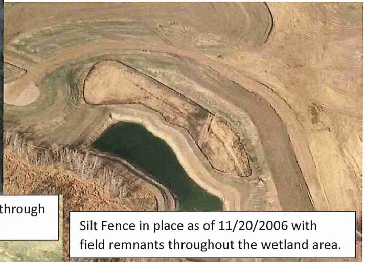
Silt Fence in place as of 11/20/2006 with field remnants throughout the wetland area.