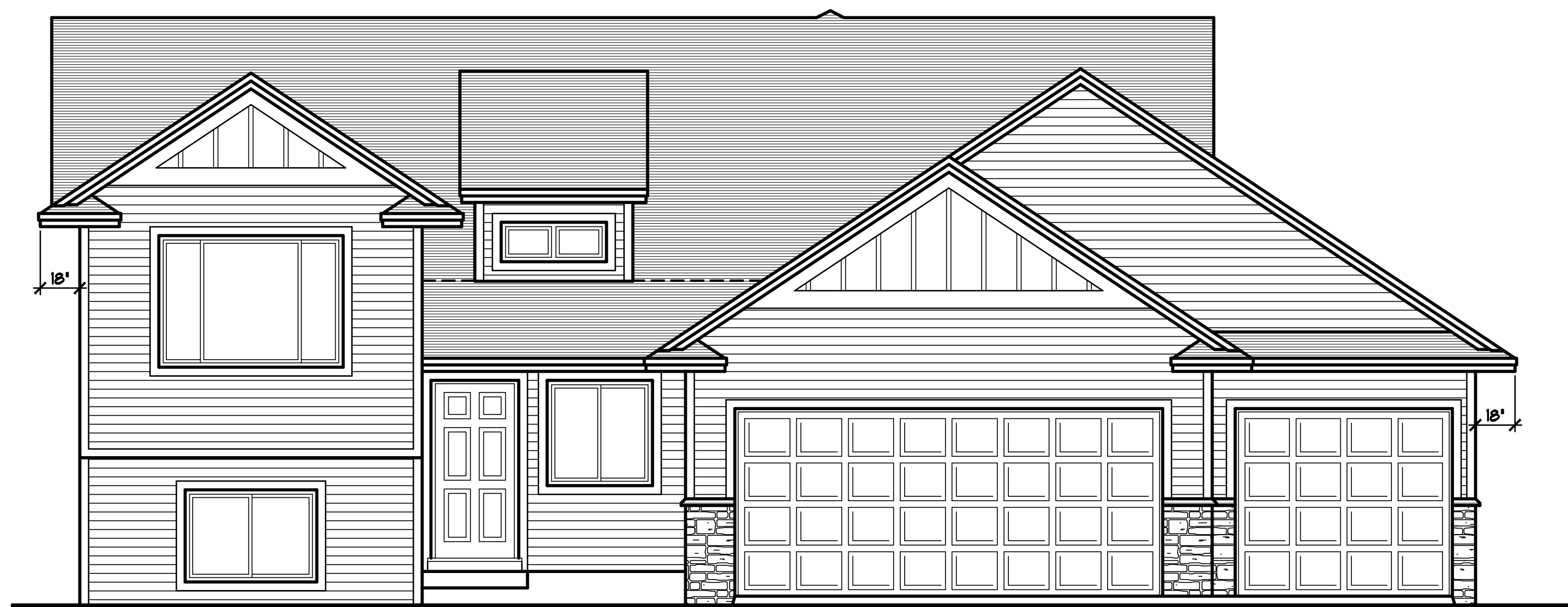
FRONT ELEVATION 1/4" = 1'-0" 1315 SQFT. MAIN LEVEL