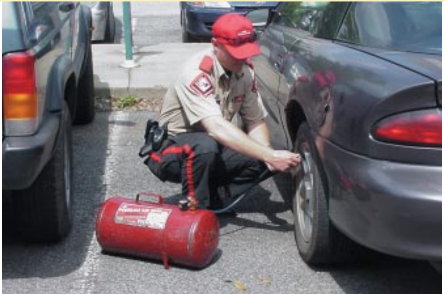
BID staff stand ready to offer assistance to stranded motorists in Birmingham, Alabama.

■ Plan holiday and other special events to give people an extra reason to visit and bond with the shopping district.