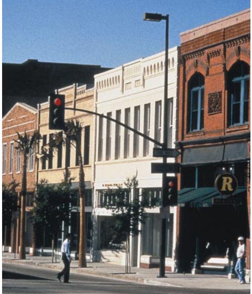
The revitalization of Old Pasadena, California, incorporated new retail trends for shopping and entertainment in a historic main street environment.

right to rebuild them. Numerous metropolitan trends are redirecting growth back into existing communities, which has positive implications for the rebirth of neighborhood retailing. Urban lifestyles are becoming more popular among empty nesters, singles, the elderly, and nontraditional households; immigrants are flocking to many neighborhood streets as low-cost places to open small businesses, stores, and restaurants; retailers are again interested in urban locations because their traditional suburban markets are saturated; states are increasingly concerned about the effects of sprawl and are instituting smart growth policies; pedestrian-oriented, streetfront retail environments are gaining favor with today's consumers; inner-city crime has declined dramatically in the past ten years; and local governments are using increasingly sophisticated planning, regulatory, and financial incentives to encourage market-based real estate investments in distressed urban neighborhoods.