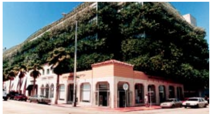
The parking garage at Seventh and Collins, Miami Beach, Florida.