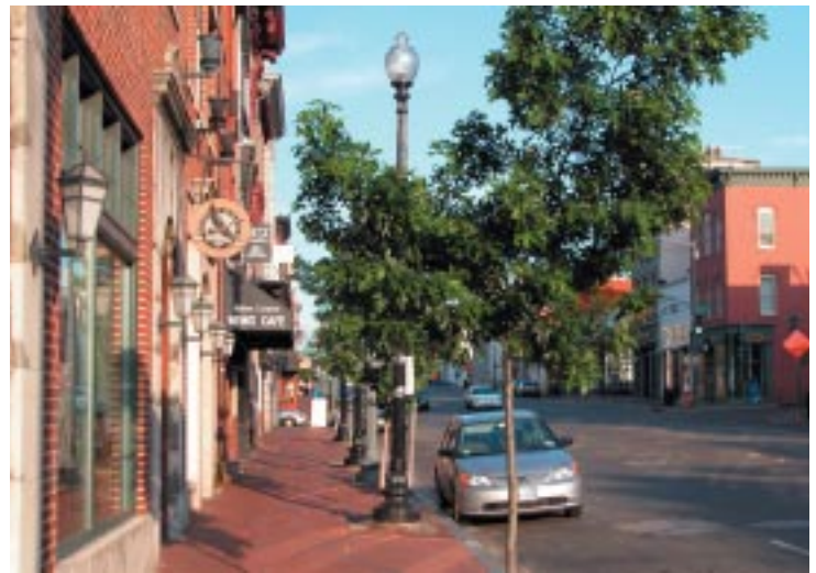
M Street, Washington, D.C.

■ Create an identity for the street that is inventive and reflects the neighborhood. Some neighborhood streets are already place-specific and have identities that can be reinforced or enhanced. In other cases, the identity is either nonexistent or negative—in which case, changing the perceived identity (or overcoming the nonidentity) will be one of the biggest challenges.