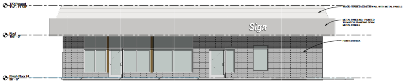
1 SOUTH (FRONT) ELEVATION 1/4" = 1'-0"