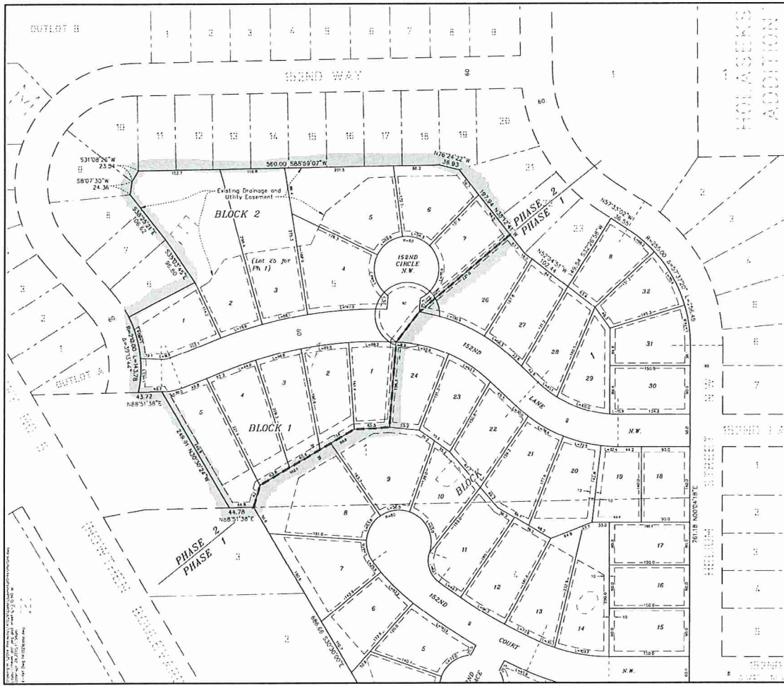
EXHIBIT B (Layout #2 - 12 Lots)