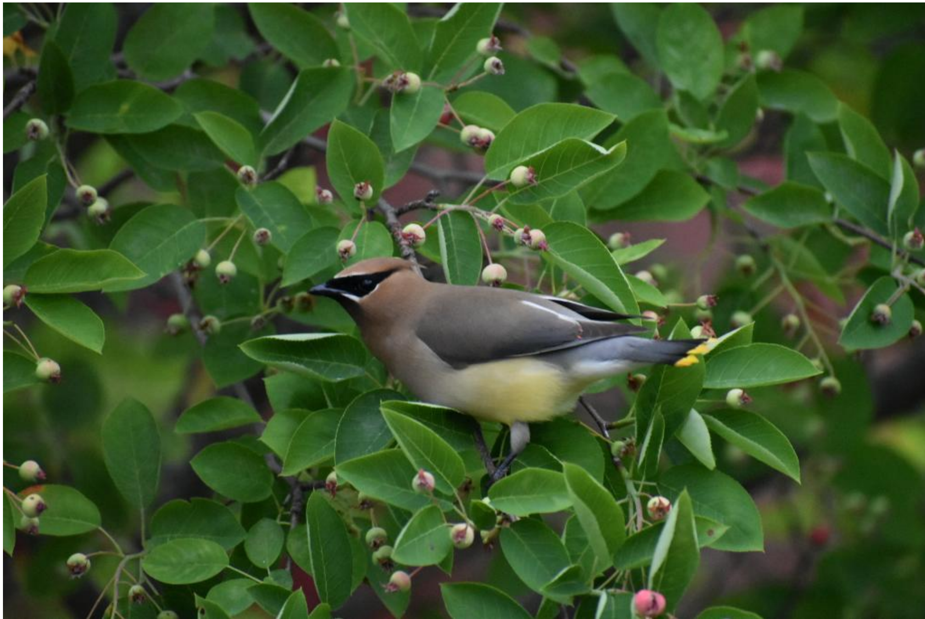
Cedar Waxwing, June 12, 2017, 145 th Lane NW