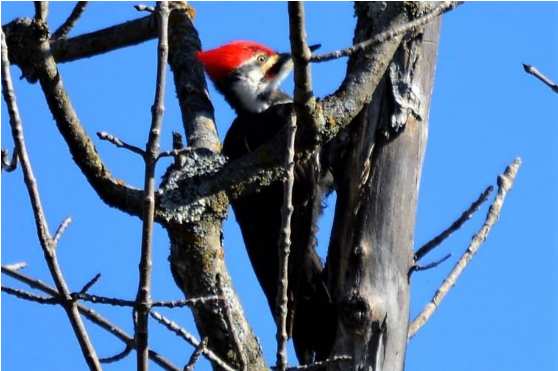
The Majestic Pileated, Spring 2016, Rum River Central Park