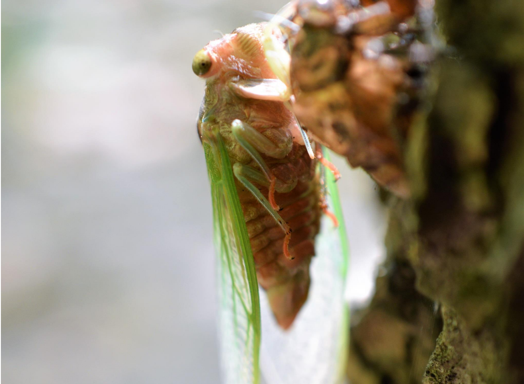
Welcome to the World, Baby Cicada, Summer 2017, Neon Street