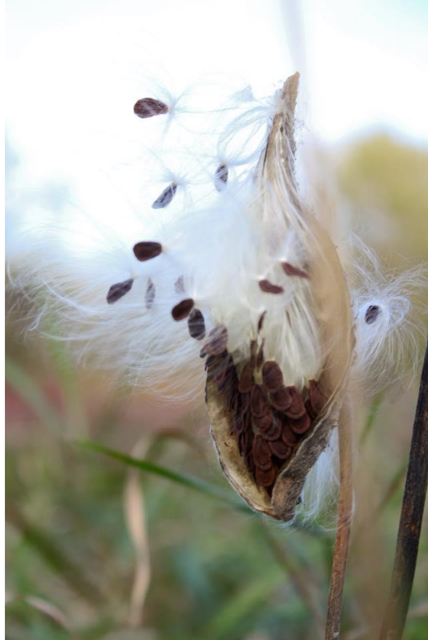
Blowin' Away, October 8, 2017, Rum River Central Park