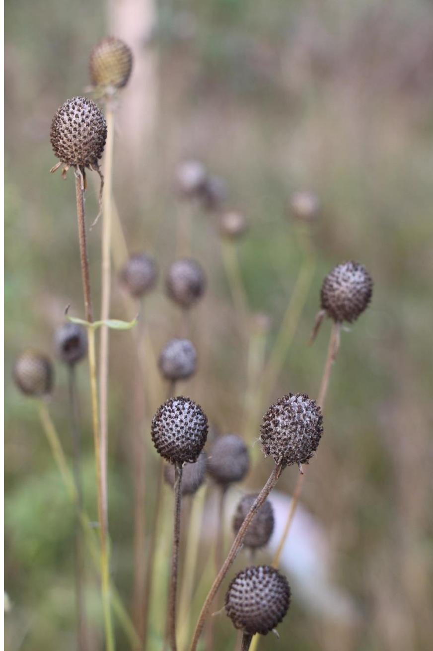
Changes, September 2017, Alpine Park