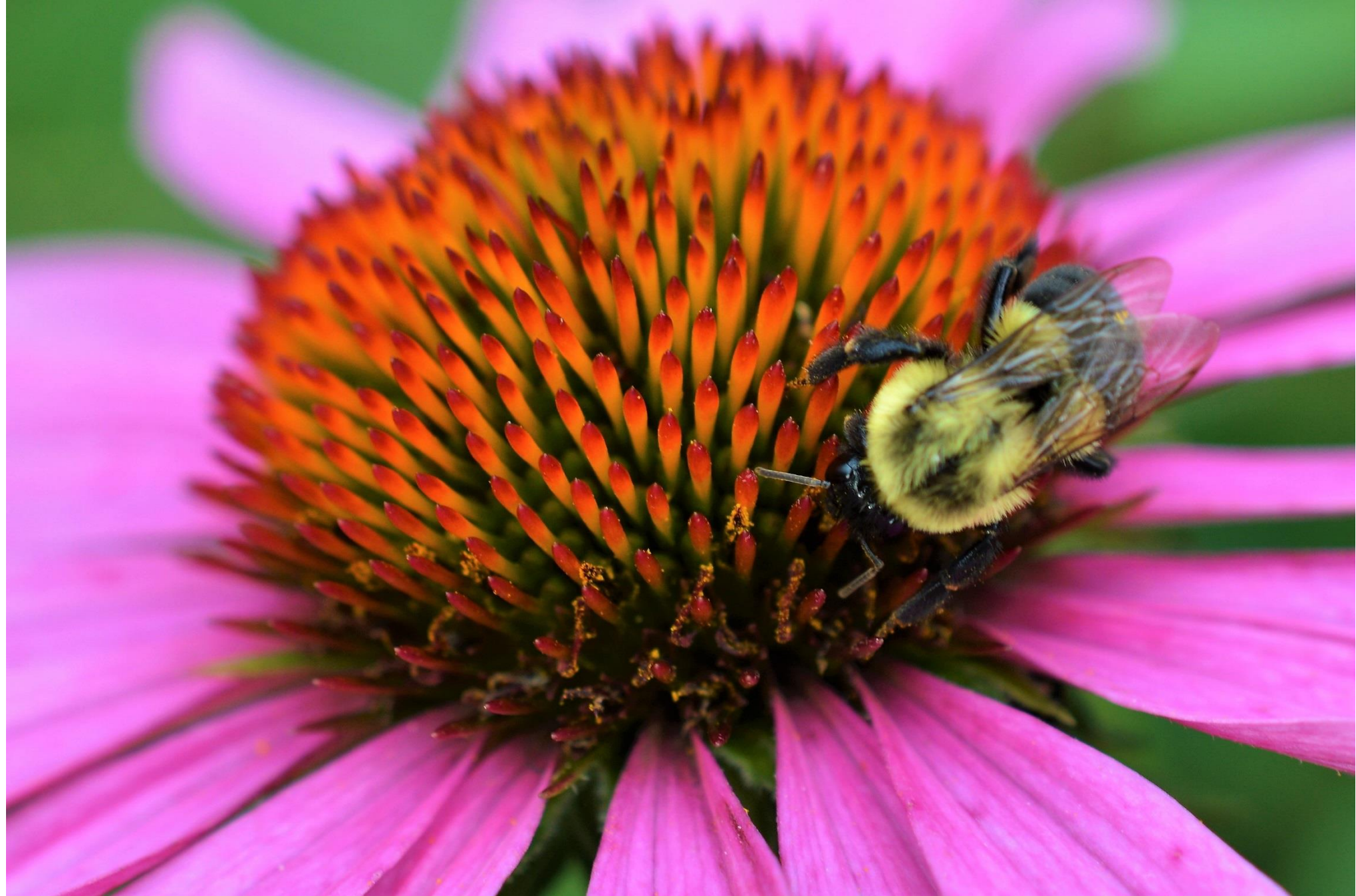
Feasting on the Purple Coneflower, Summer 2017, Mississippi West Regional Park