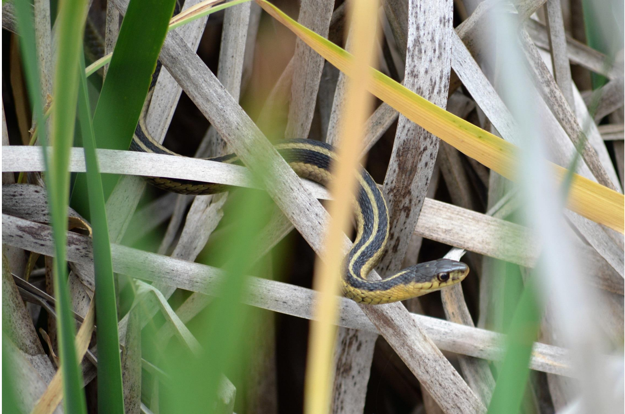
On the Hunt, Summer 2015, Sunfish Lake Park