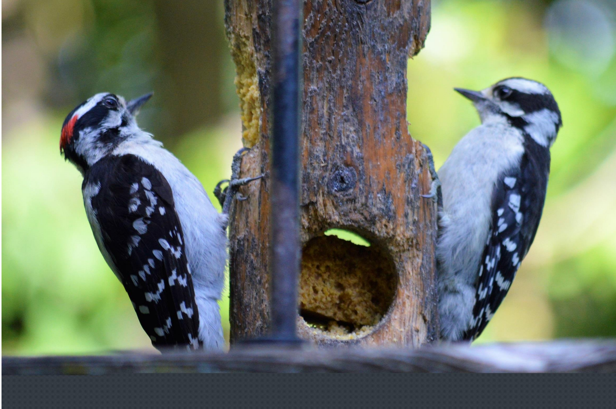
Family Meal, Summer 2017, Neon Street