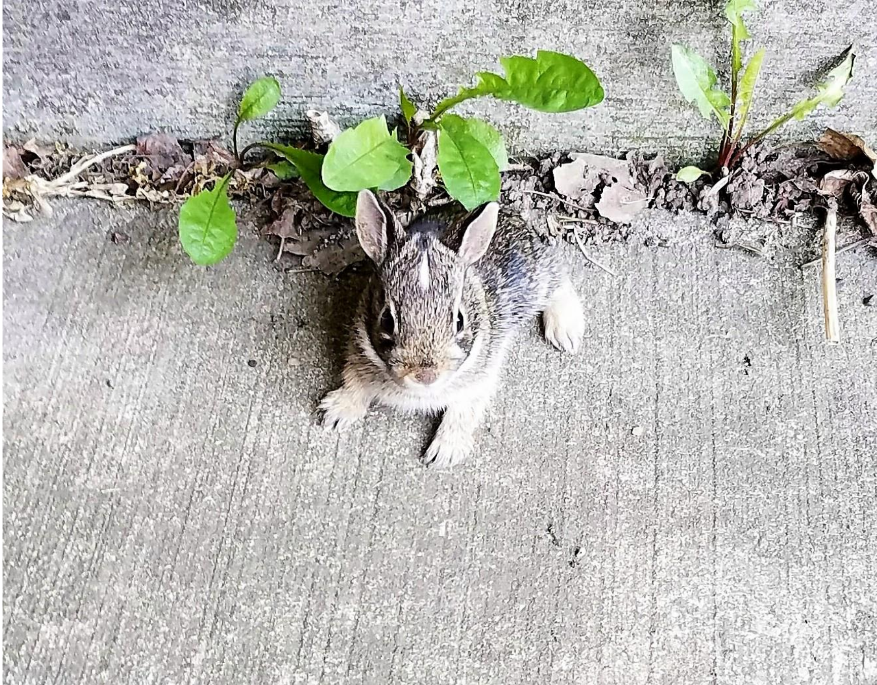
Lost Bunny, Spring 2016, Rum River nature area