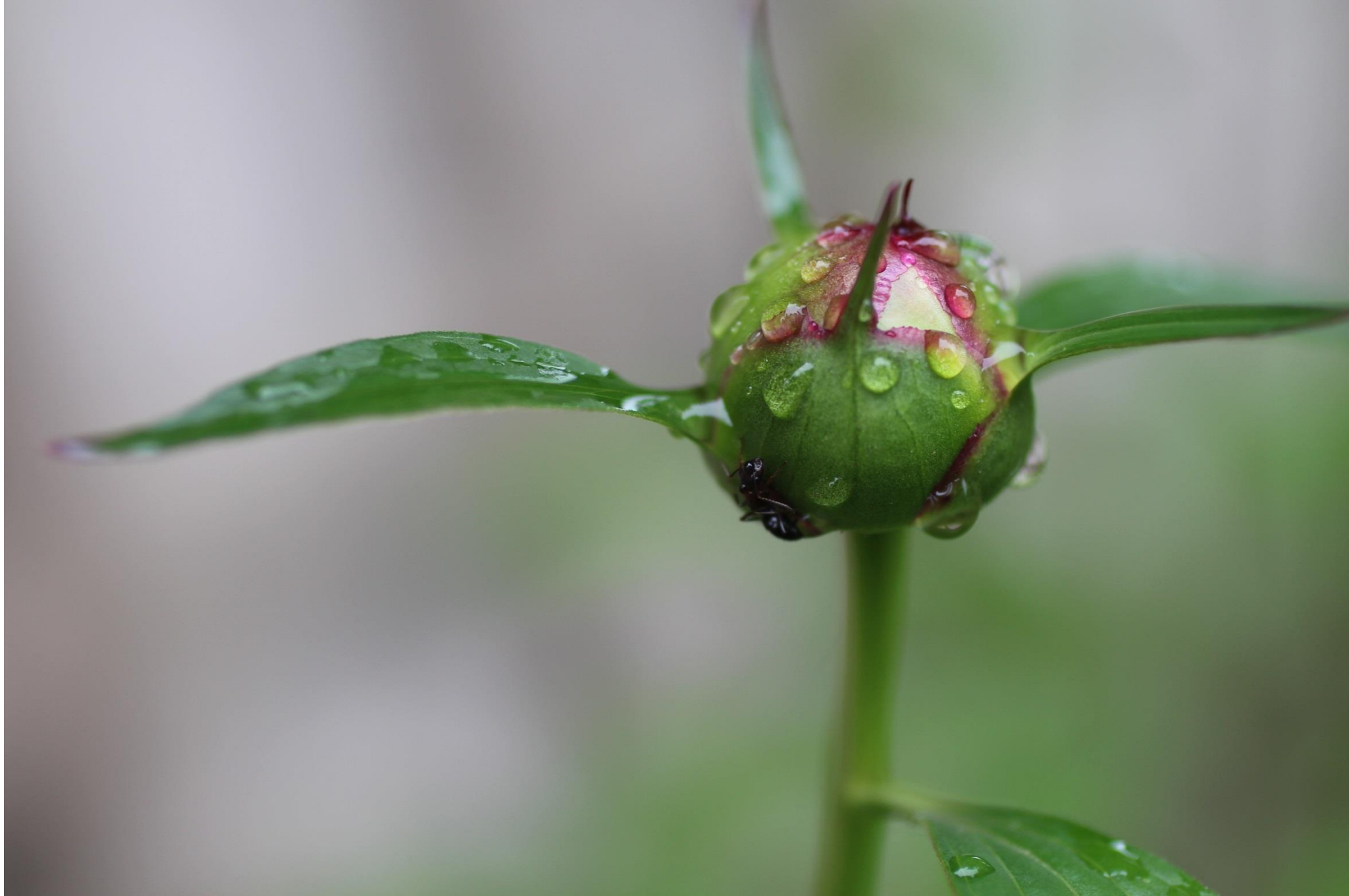
Before the Bloom, June 2017, Xenon Street