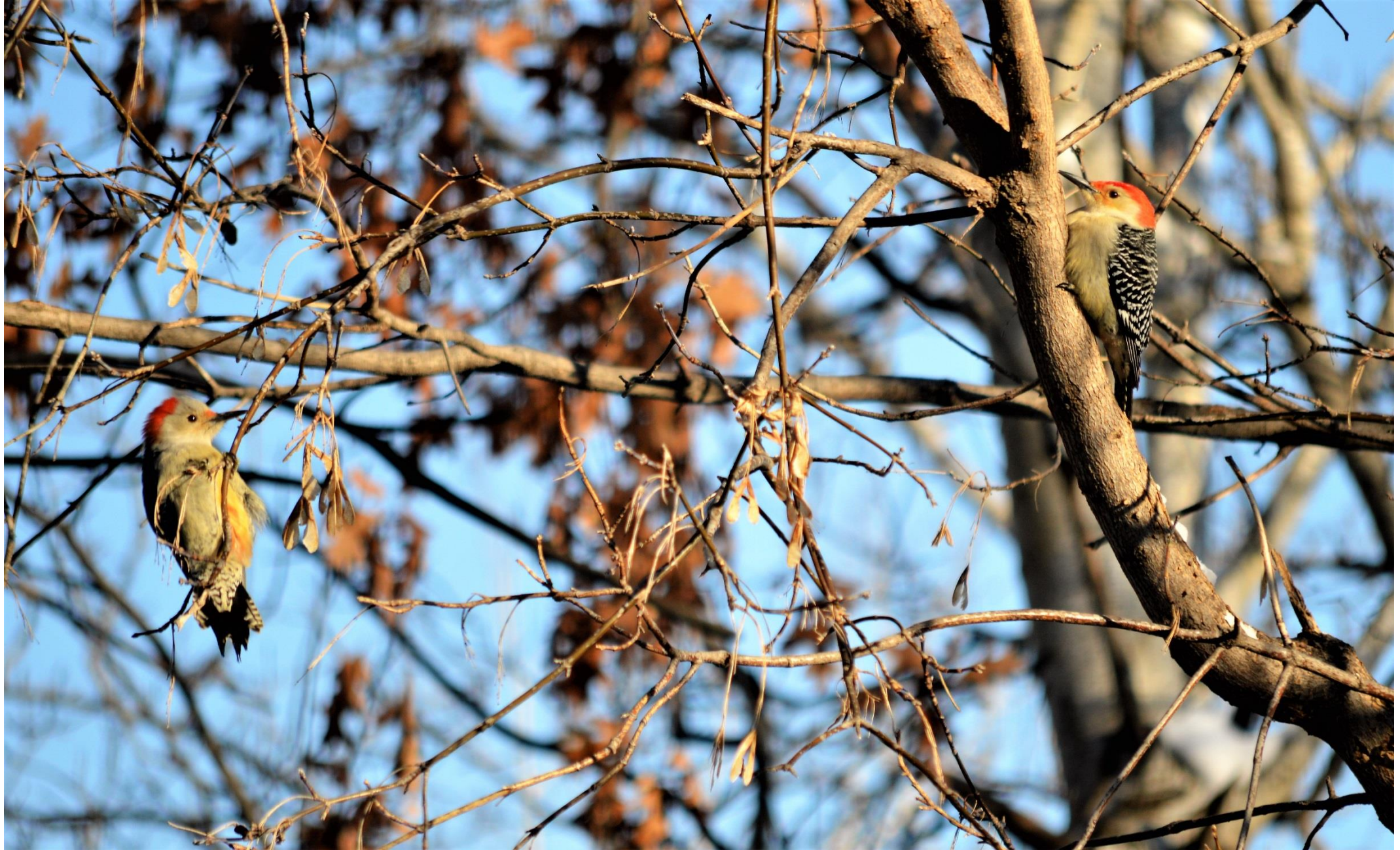
Baby Woodpeckers, Spring 2017, Neon Street