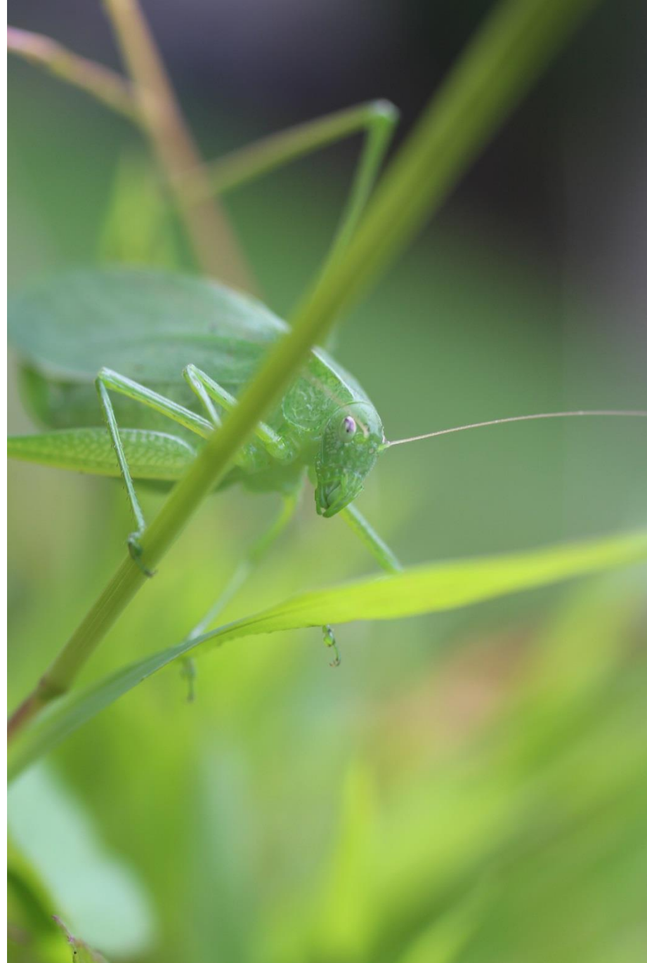
Katydid, August 2017, Xenon Street