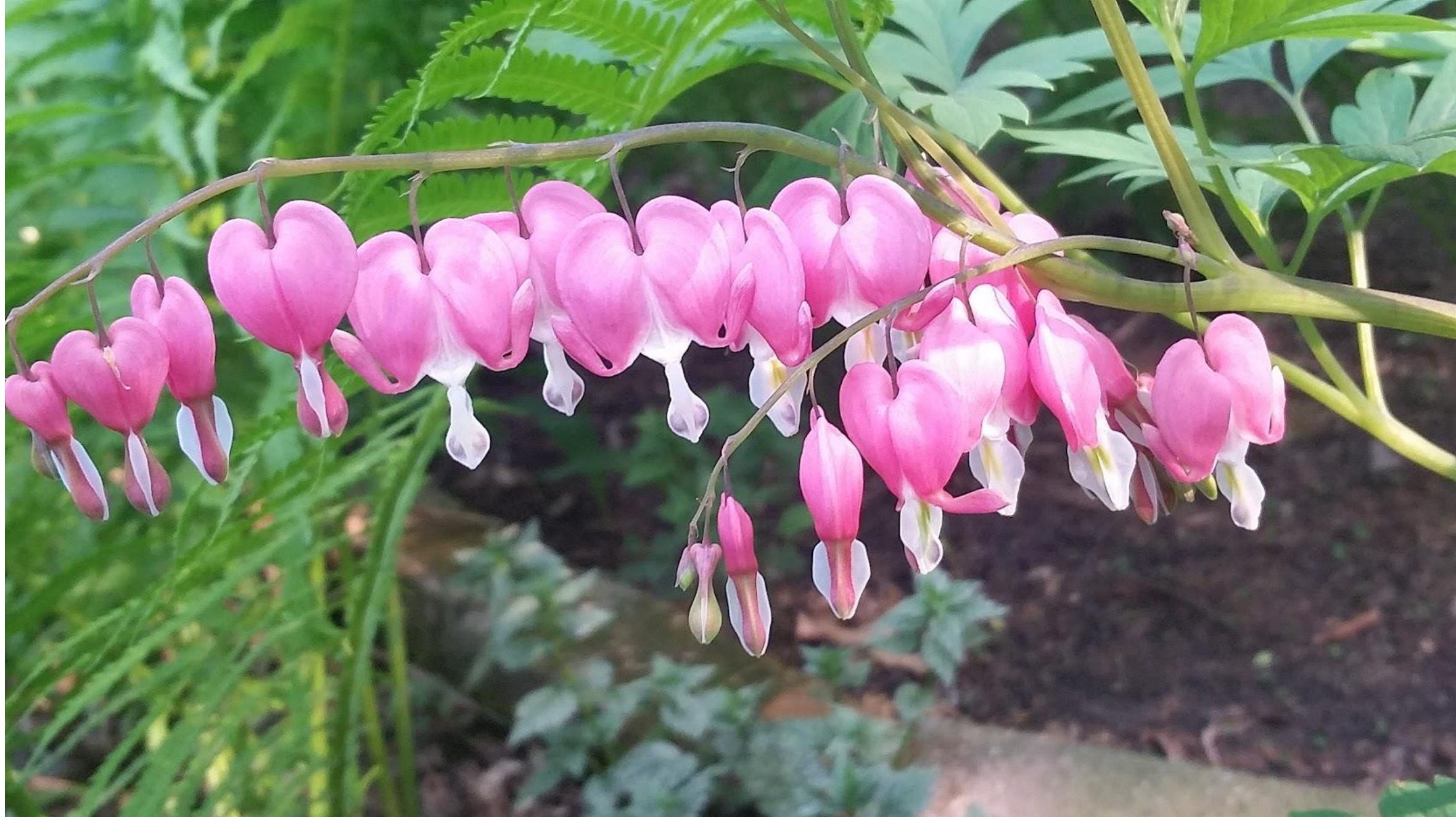
Bleeding Hearts, May 2016, Juniper Ridge Drive