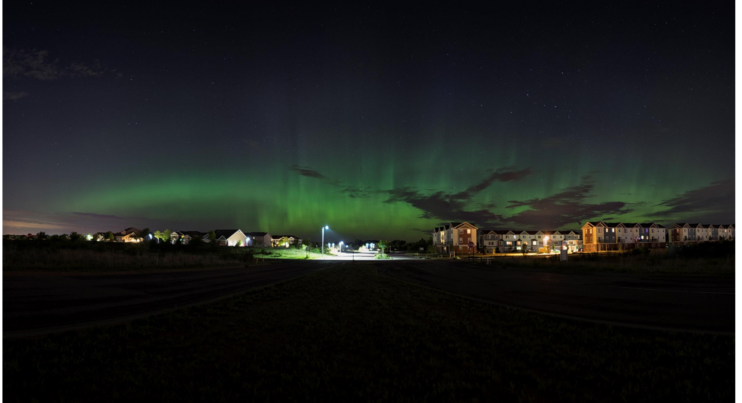
The Aurora Over Bunker Lake Boulevard, May 28, 2017