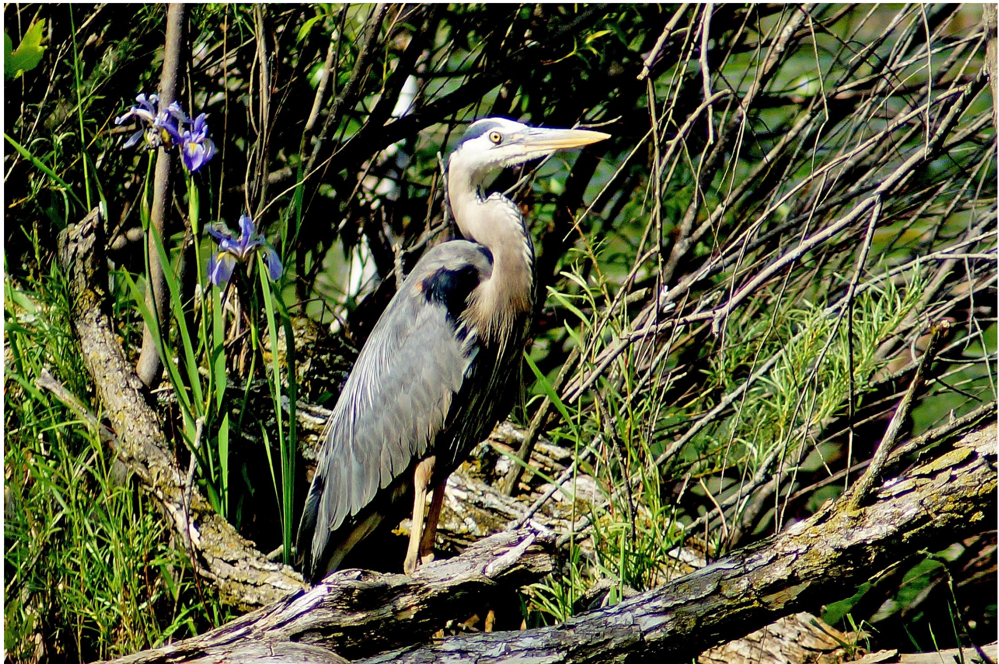
Great Blue Heron, June 7, 2017, Pond on County Roads 63 and 5