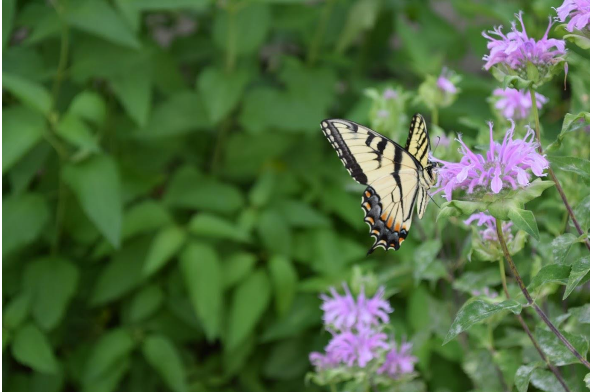
A Sign of Summer, July 2015, Juniper Ridge Drive