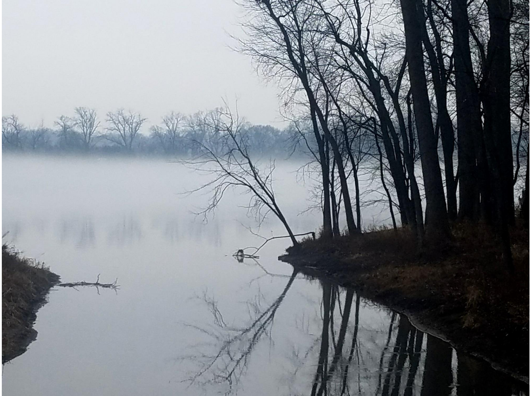
Winter Fog, December 4, 2017, Mississippi River at Rivlyn Avenue