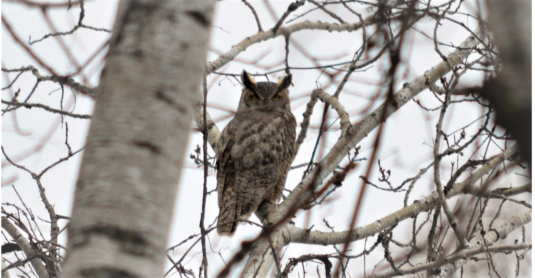
The Wise Great Horned Owl, Fall 2015, Neon Street