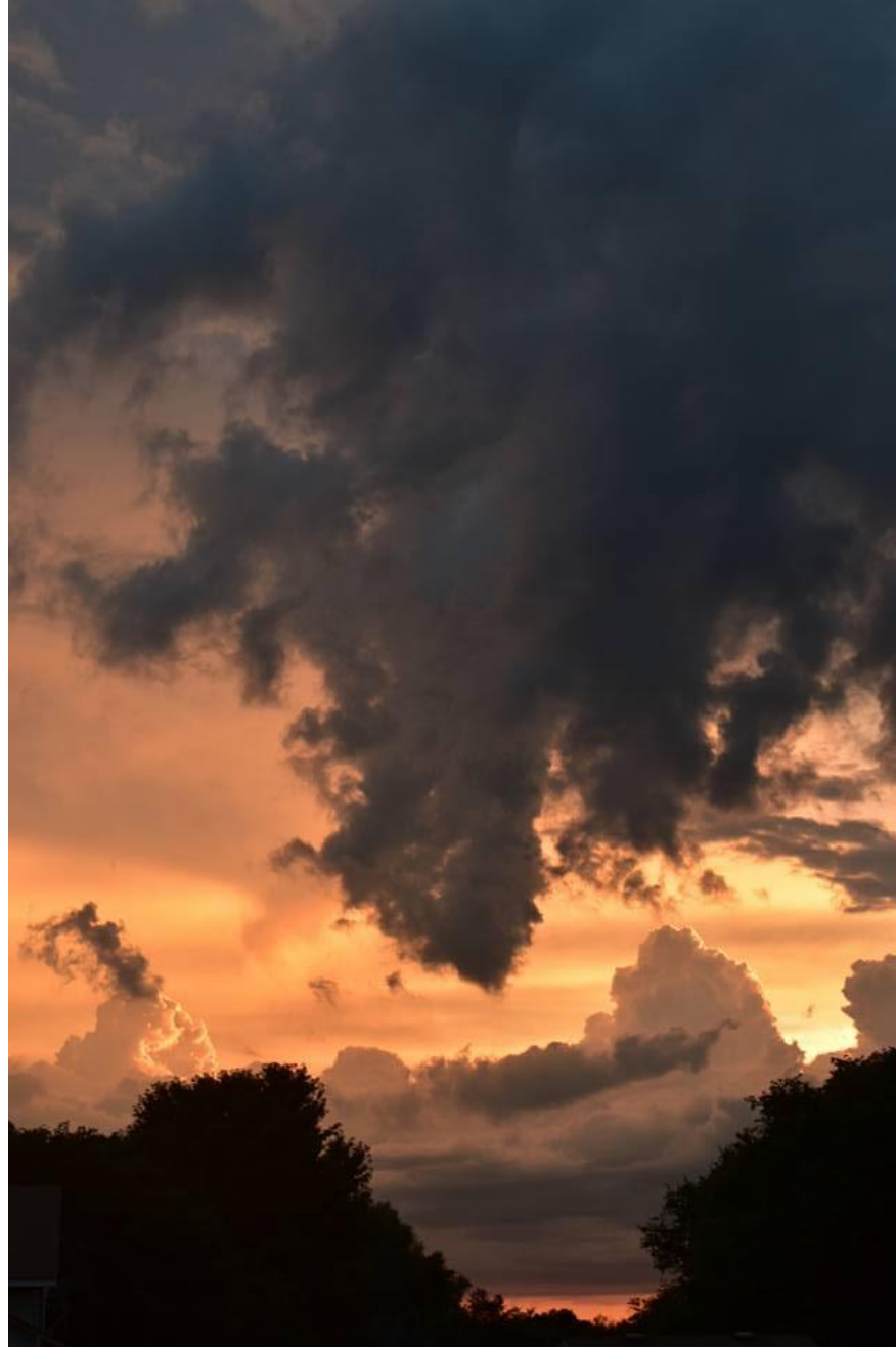
Cloudy, July 1, 2017, 145 th Lane NW