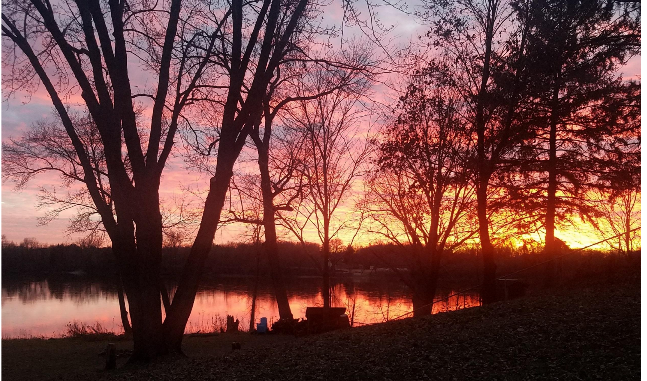
Fire in the Sky, Mississippi River at Rivlyn Avenue