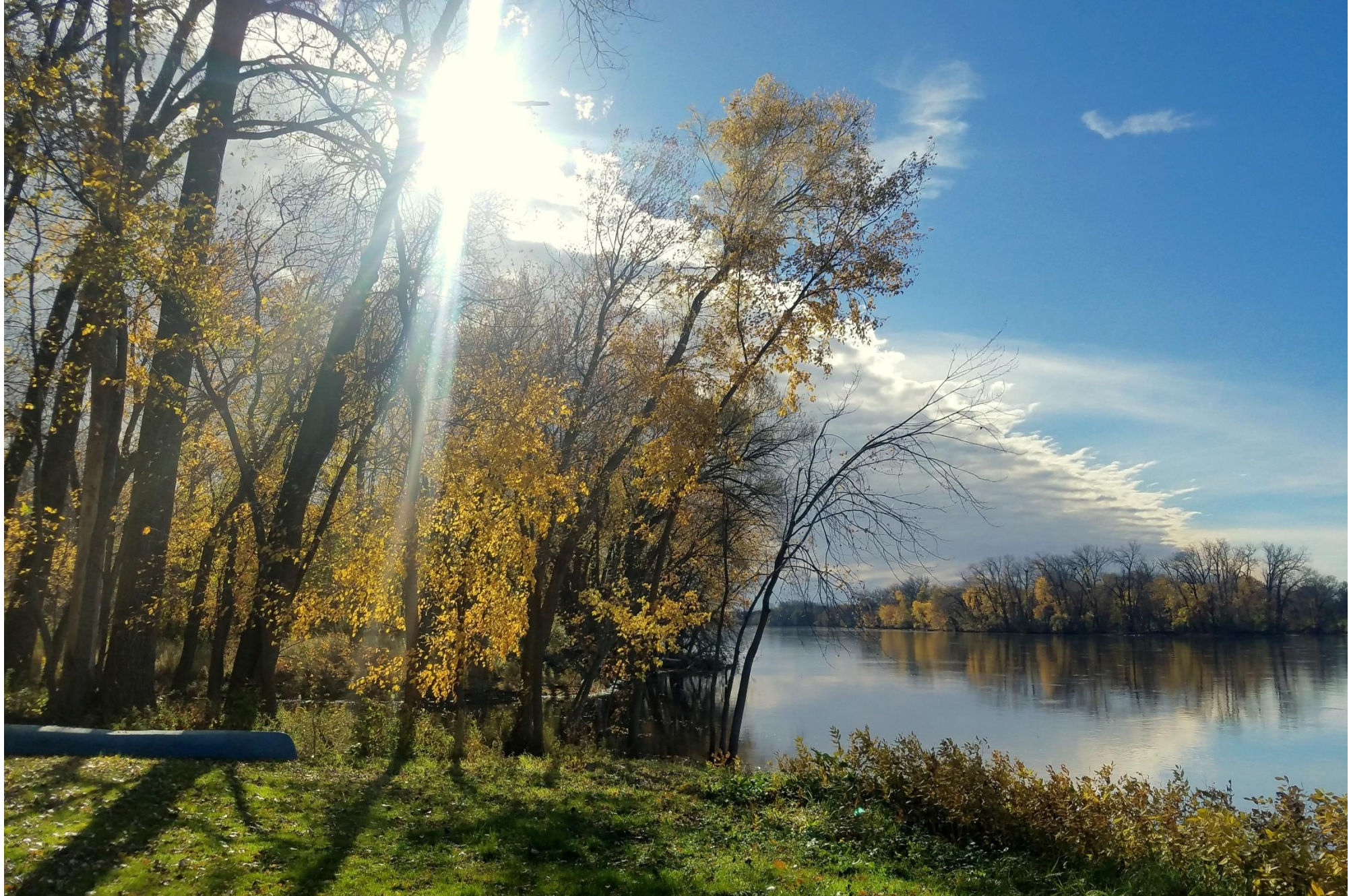
Fall Sky, October 22, 2017, Mississippi River at Rivlyn Avenue