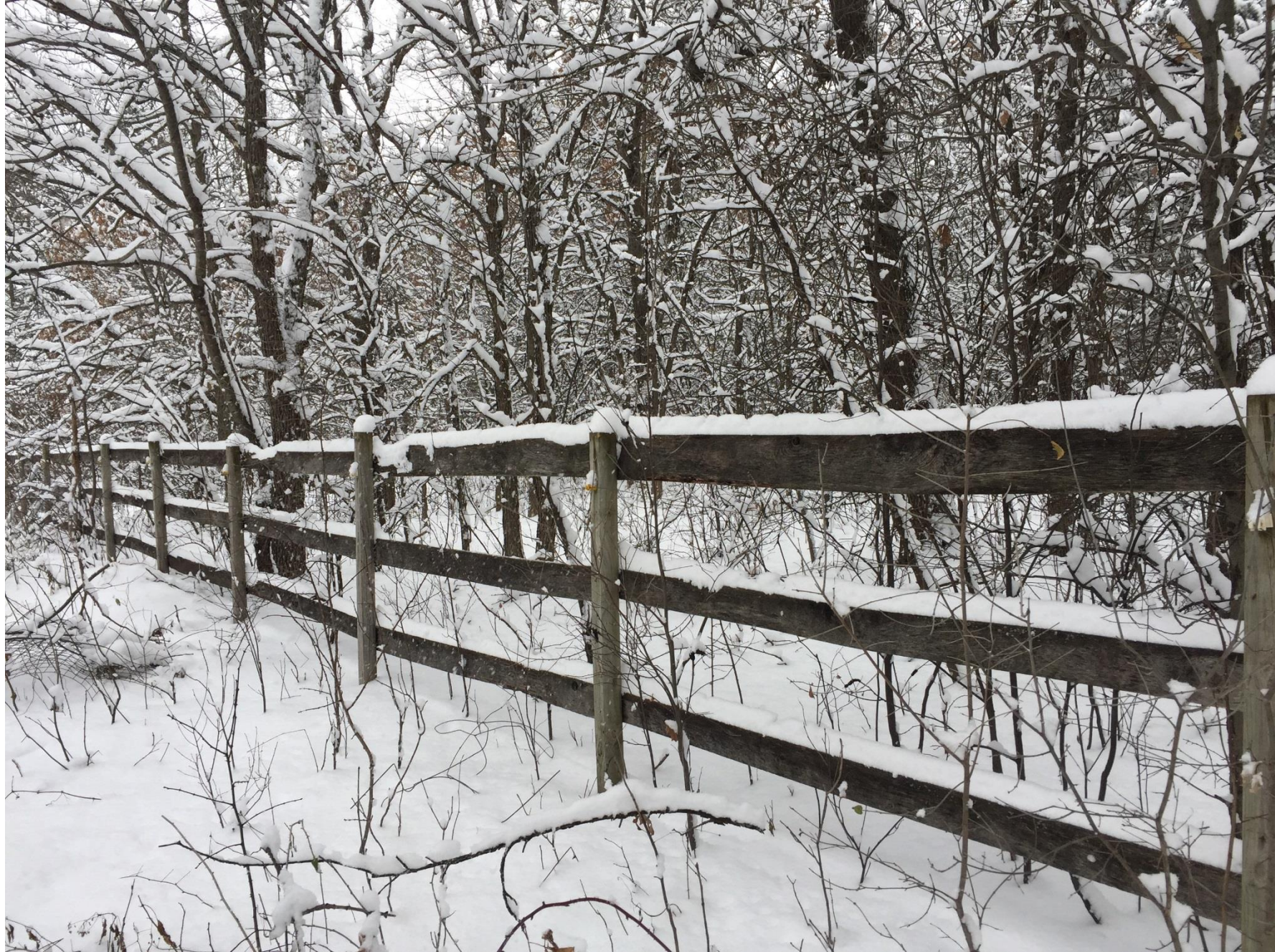
Fenceline, December 2016, Alpaca Street