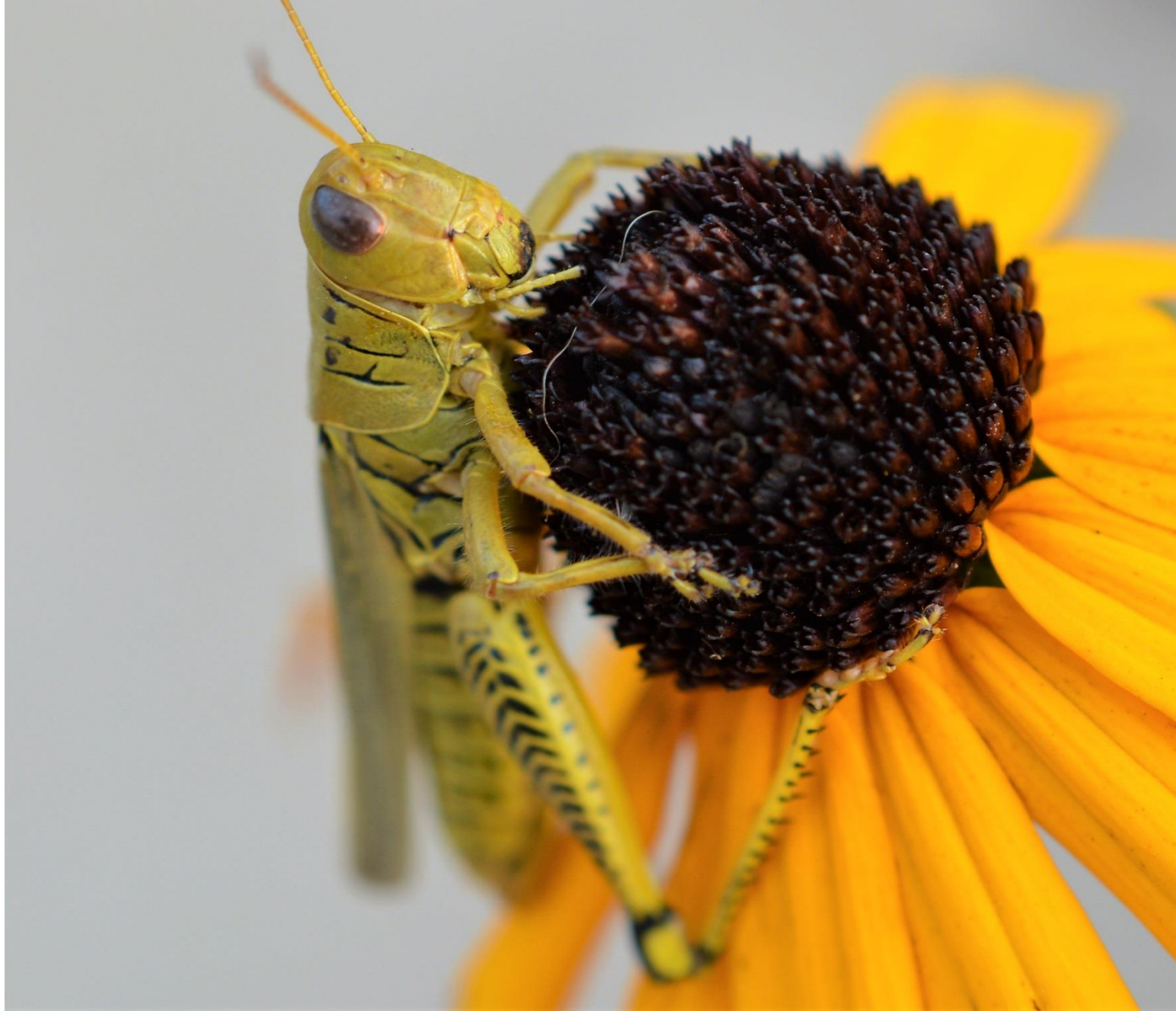
Bright Eyed and Black Eye Susan, Fall 2016, Rum River Central Park