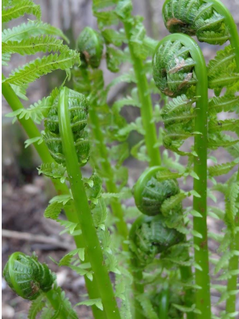
Spring Ferns, April 2017, Juniper Ridge Drive