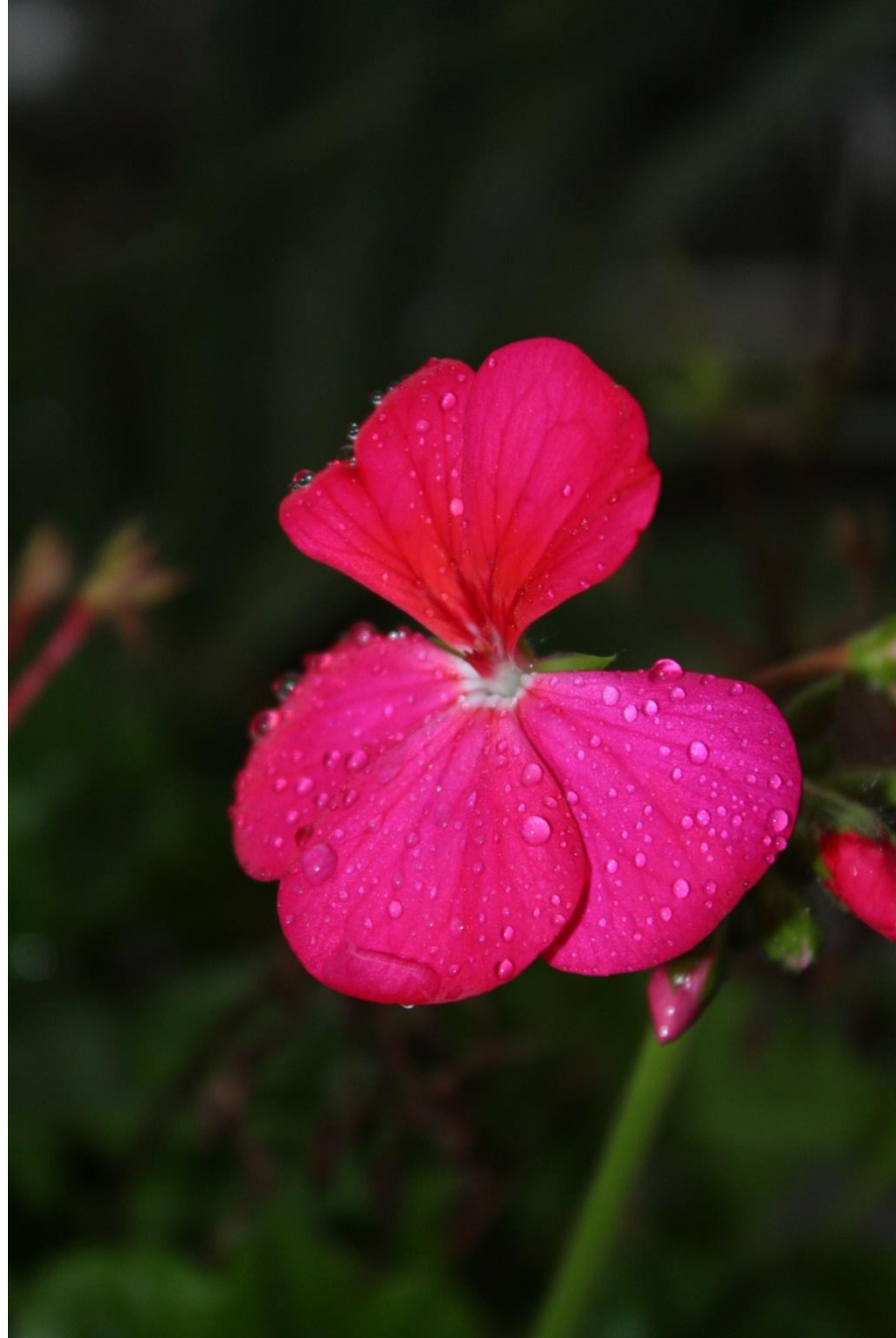
Drops of Rain, October 26, 2017, Junkite Street