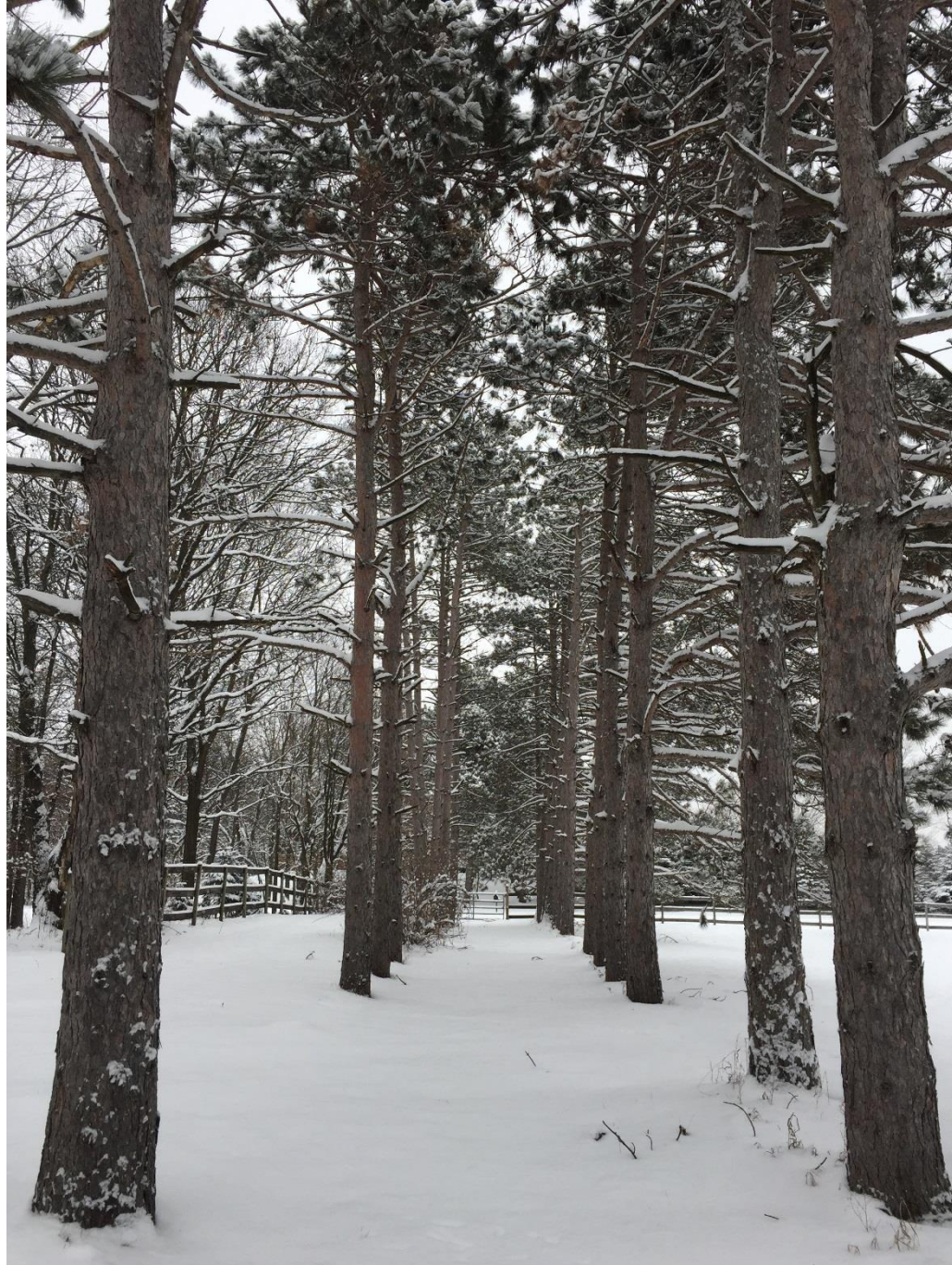
Evergreen Line, December 2016, Alpaca Street