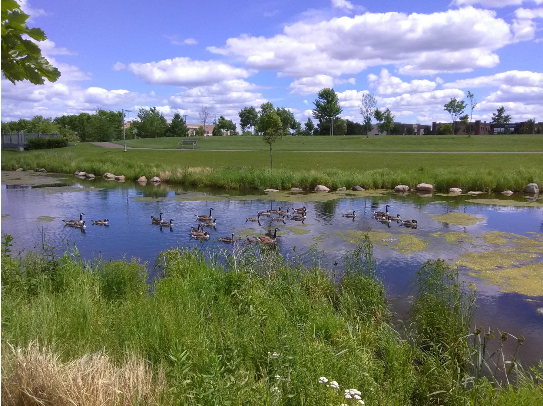
Geese, The Draw