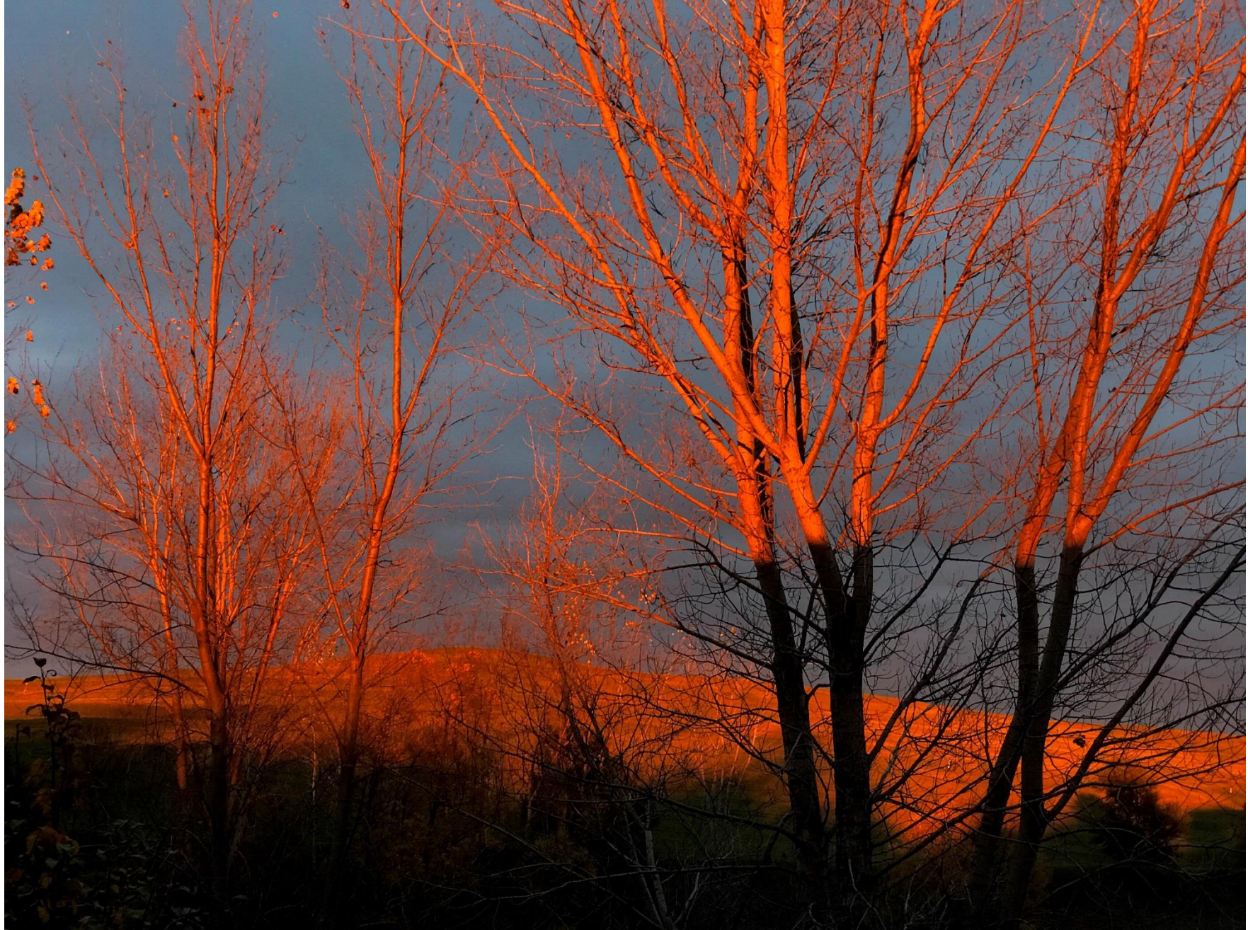
The Anoka/Ramsey Closed Landfill at Sunset, October 23, 2017