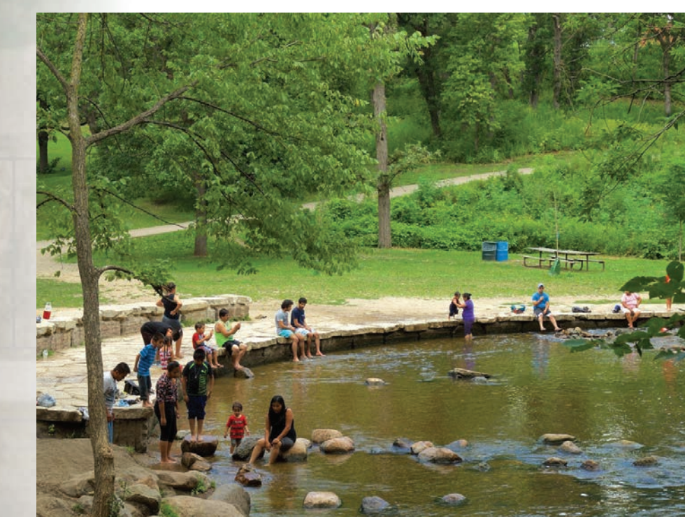
Water Gathering: Wading