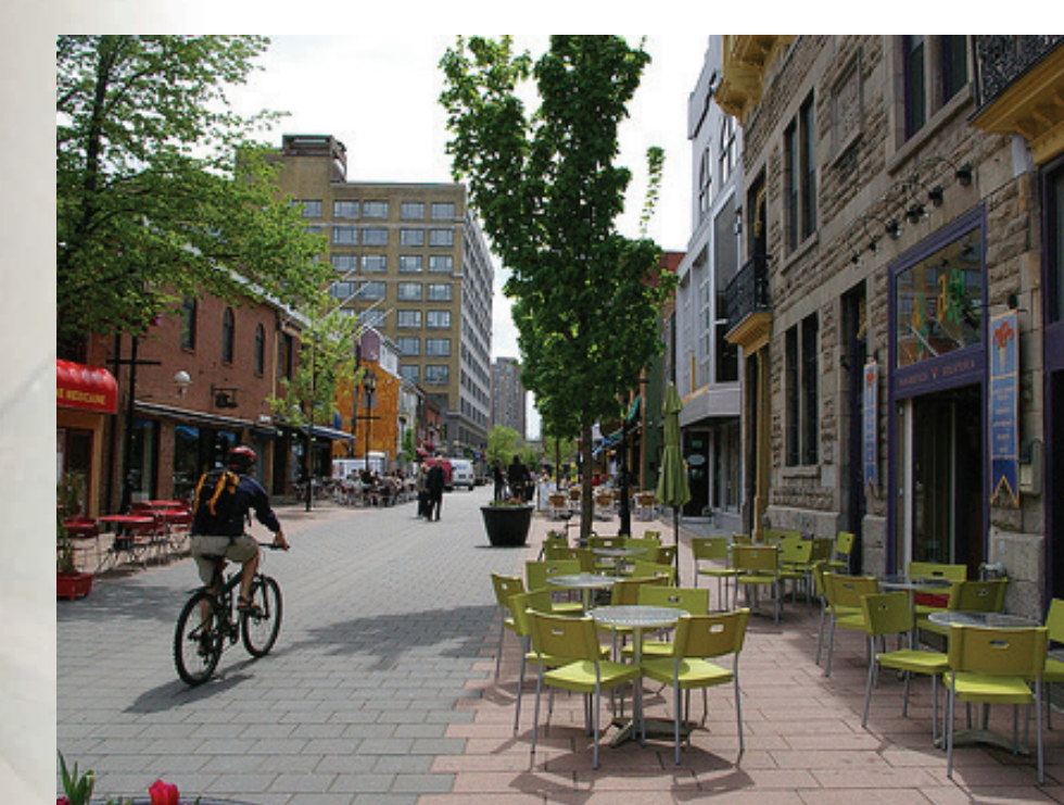
Shared Street (Woonerf)