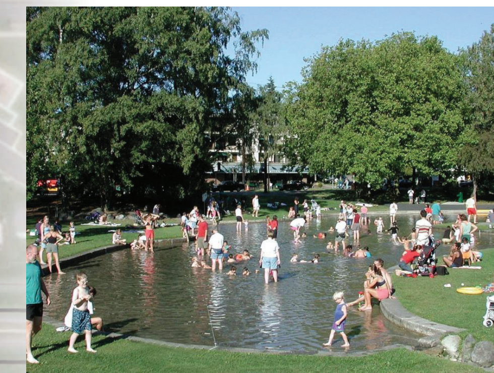
Water Gathering: Wading