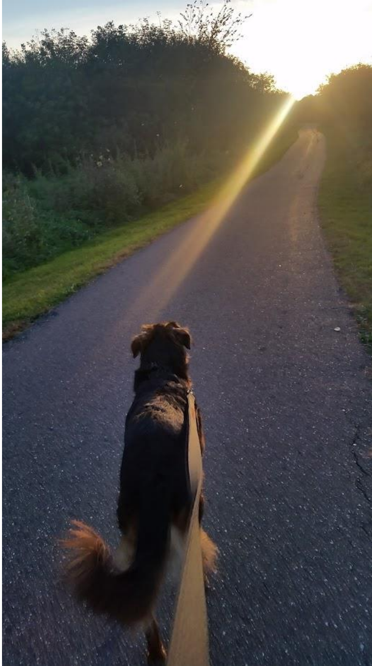
End of the Day Walk, October 2016, Elmcrest Park