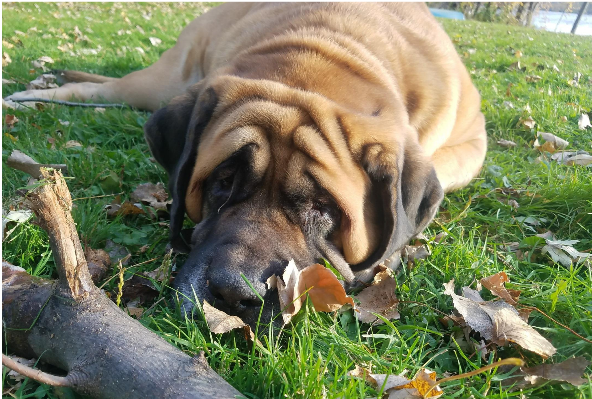
River Dogs Life, Mississippi River at Rivlyn Avenue