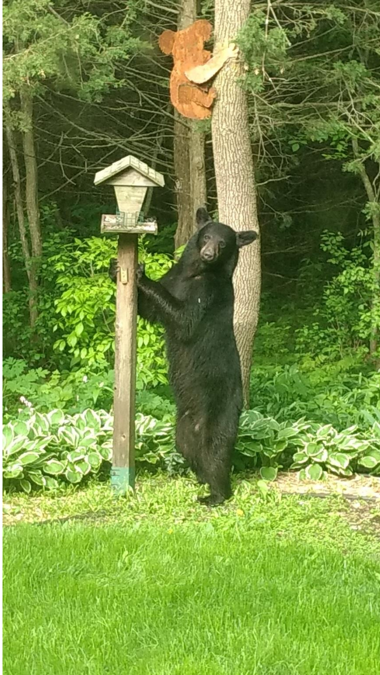
Bears in the Backyard, May 2017, Juniper Ridge Drive