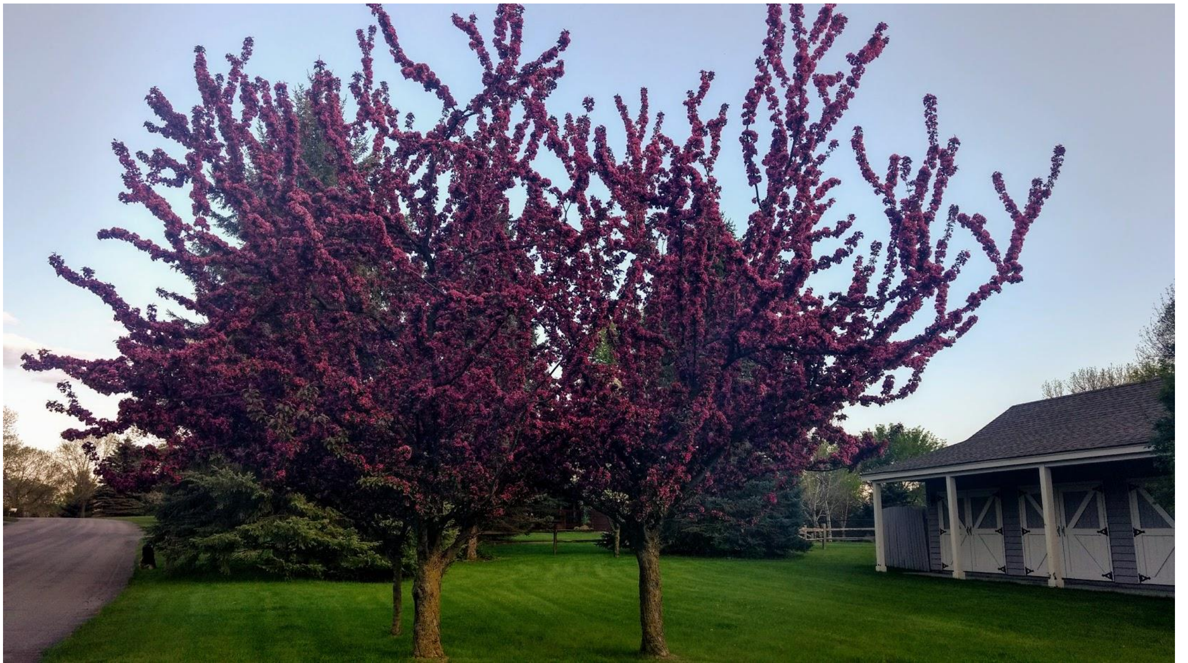
Spring Color, May 2017, Juniper Ridge Drive