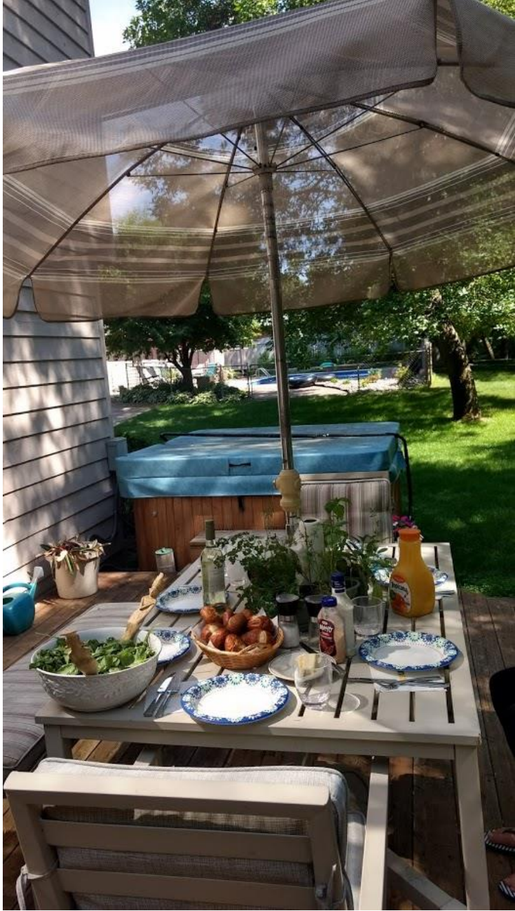
Summer Dinner, July 2017, Juniper Ridge Drive