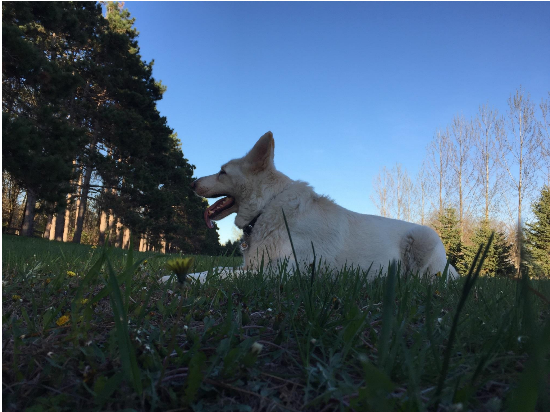
Resting in the Grass, April 2016, Alpaca Street