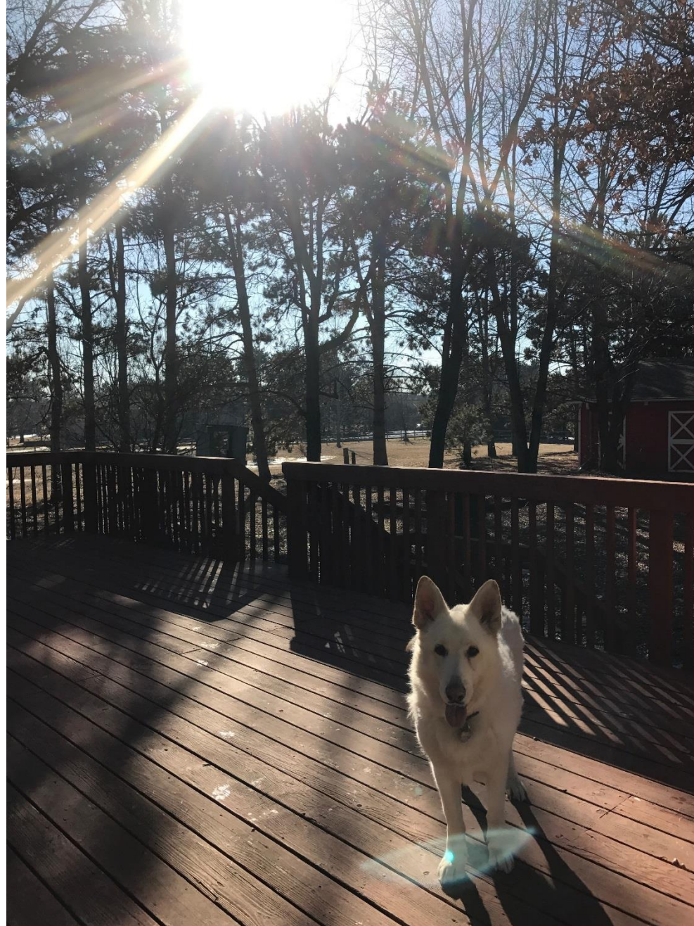
Warm February Day on the Deck, February 2017, Alpaca Street