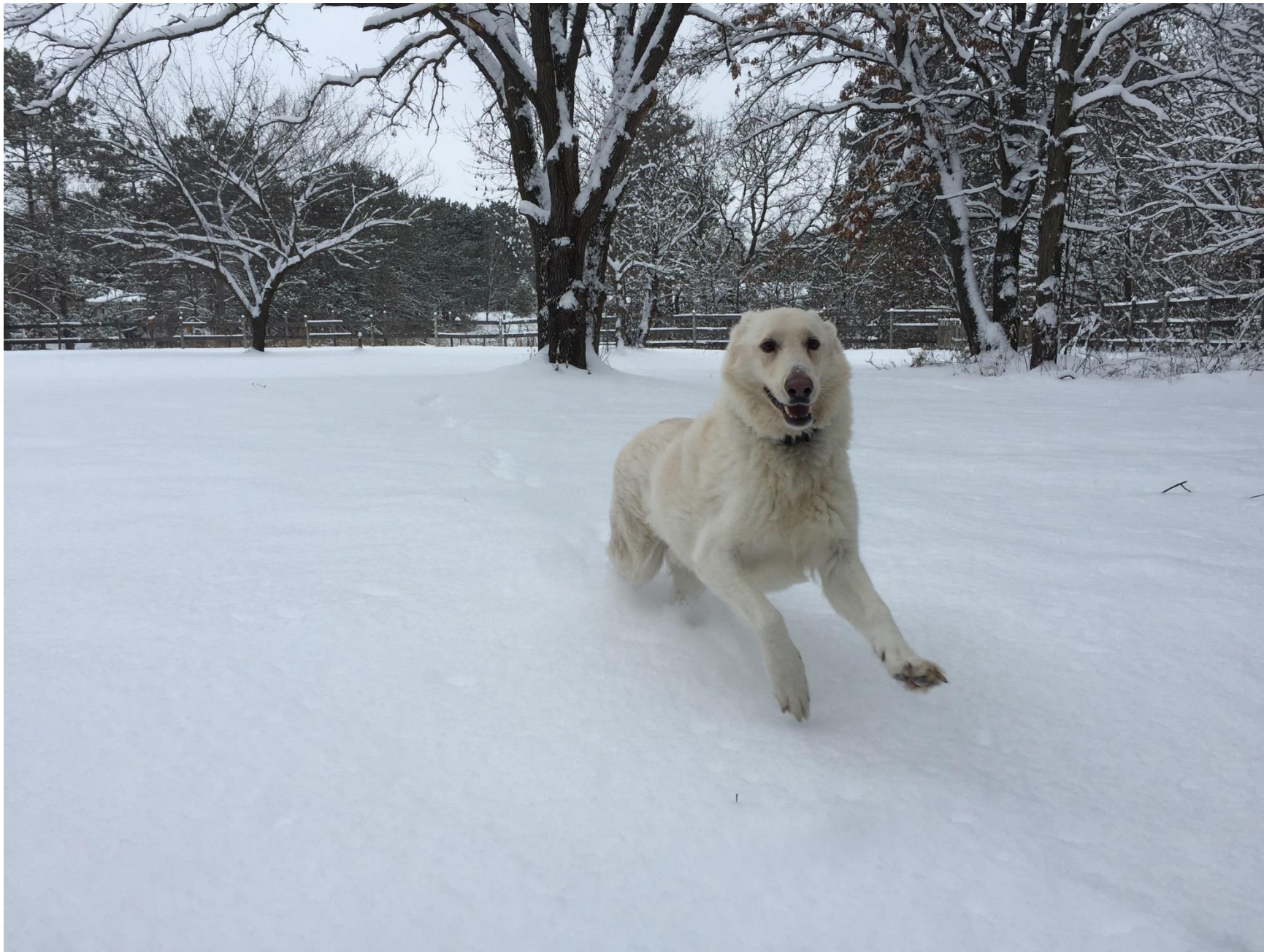
Fun in the Snow, December 2016, Alpaca Street