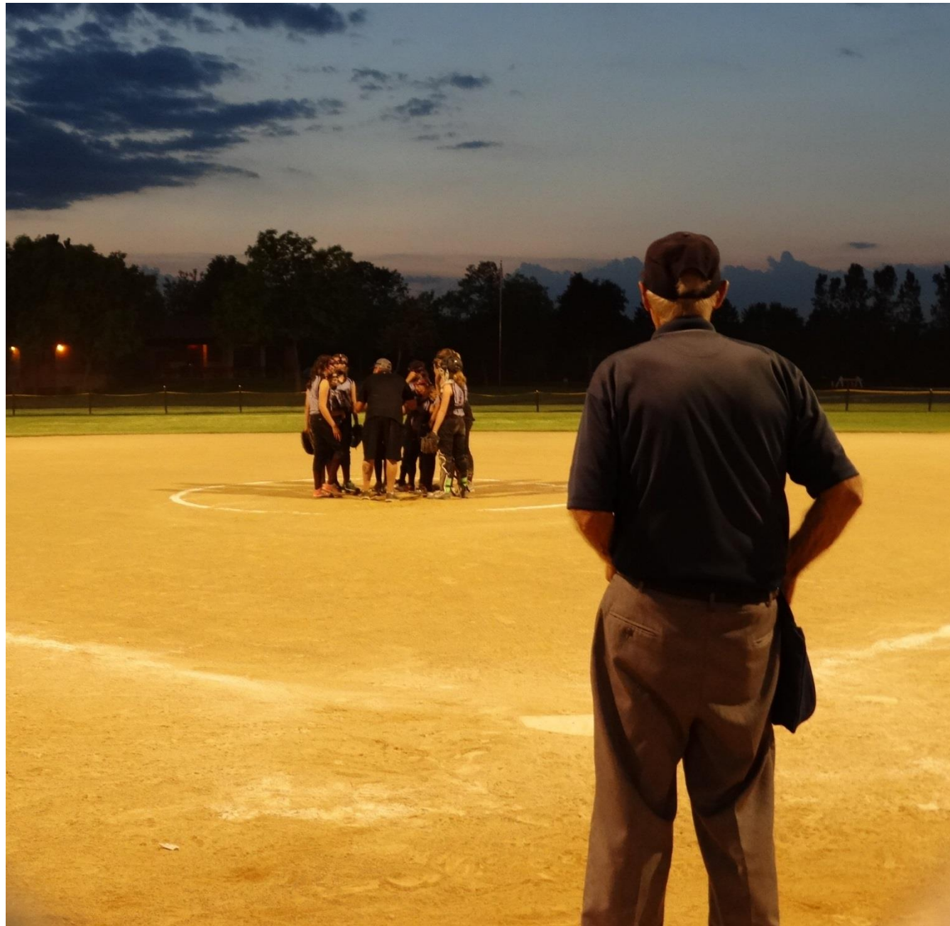
Team Huddle, June 2017, Central Park