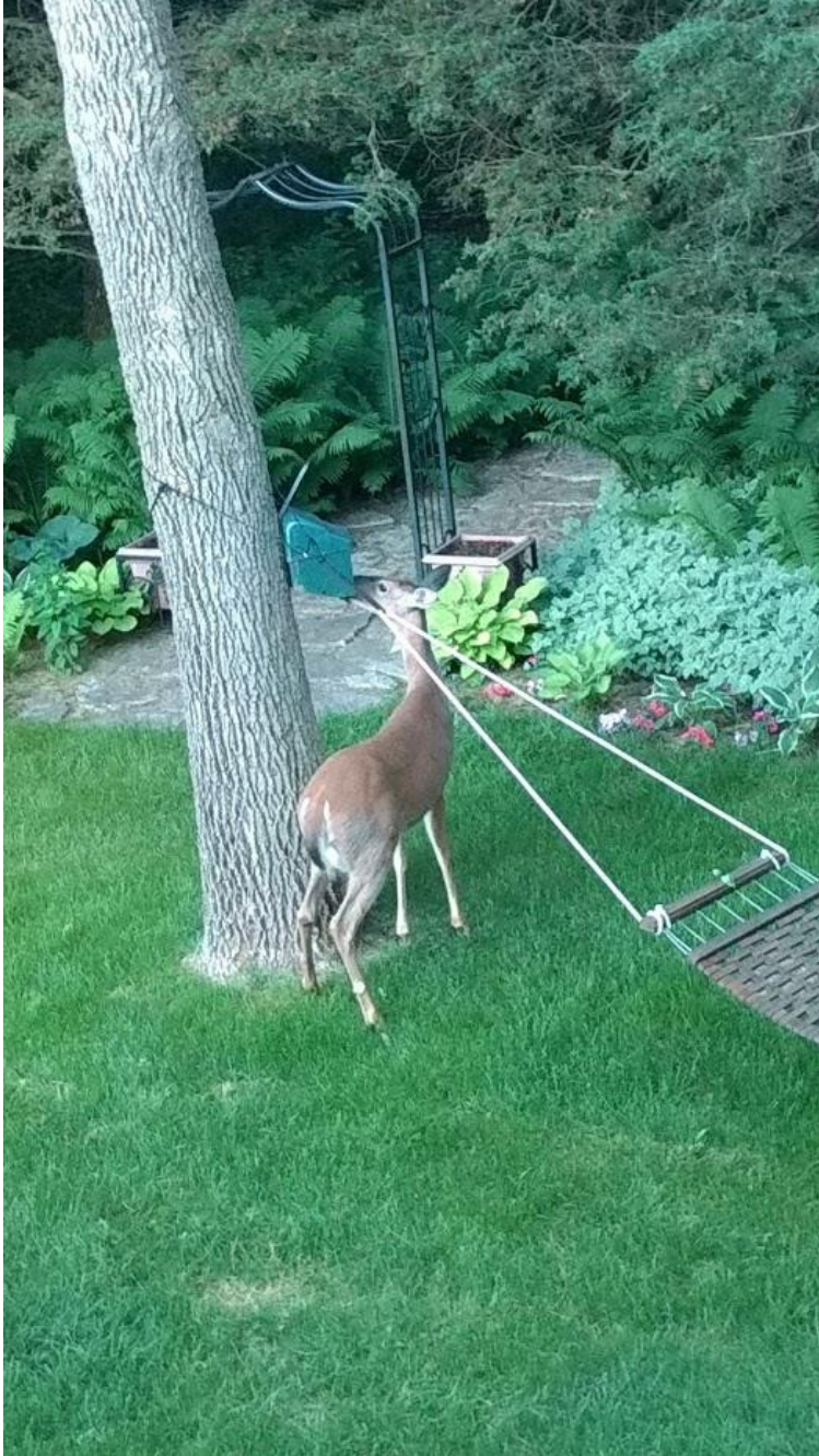
Free Lunch, June 2017, Juniper Ridge Drive