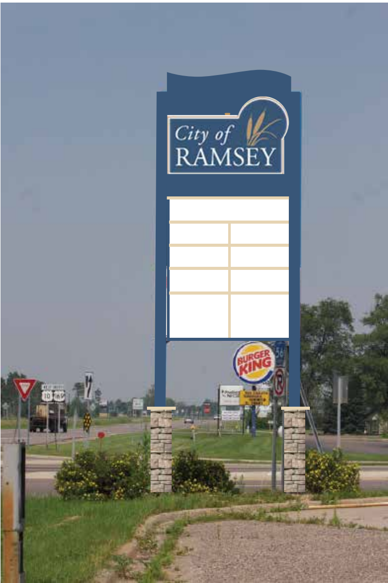
24" x 24" x 60" brick bottoms aluminum caps