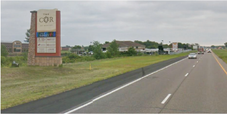
EXISTING X-LARGE SIGNAGE LOCATED ON HWY 10 NEAR CITY HALL