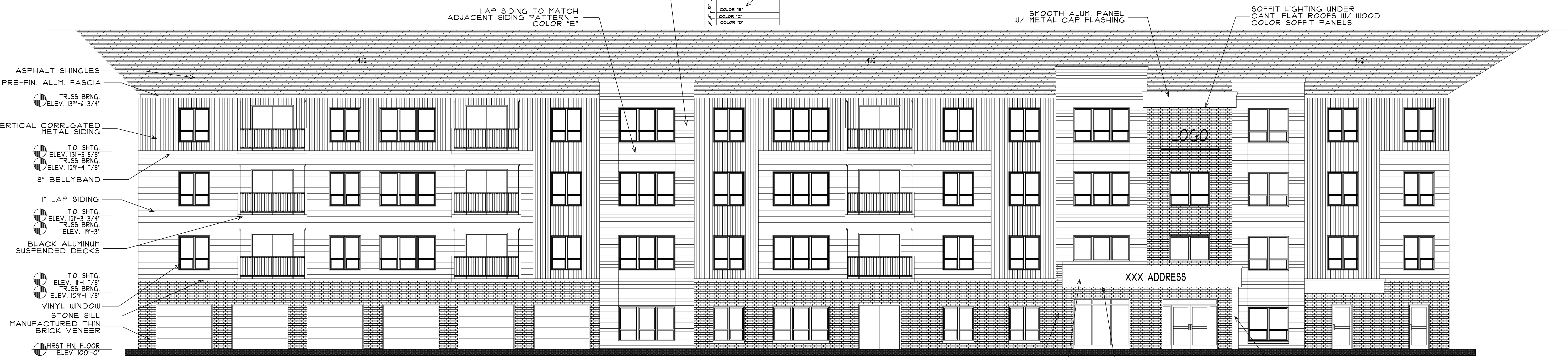
FRONT ELEVATION (SOUTH) SCALE: 1/8" = 1'-0"

NOTE: (4) DIFFERENT COLORS USED PER REPETITIVE SIDING PATTERN COLOR 'A' COLOR 'B' COLOR 'C' COLOR 'D' COLOR 'E' COLOR 'F' COLOR 'G' COLOR 'H' COLOR 'I' COLOR 'J' SCATTER THE SEAMS THROUGHOUT VERIFY SIDING COLORS W/ OWNER