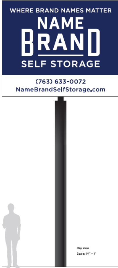
EXHIBIT "B" Sign Design