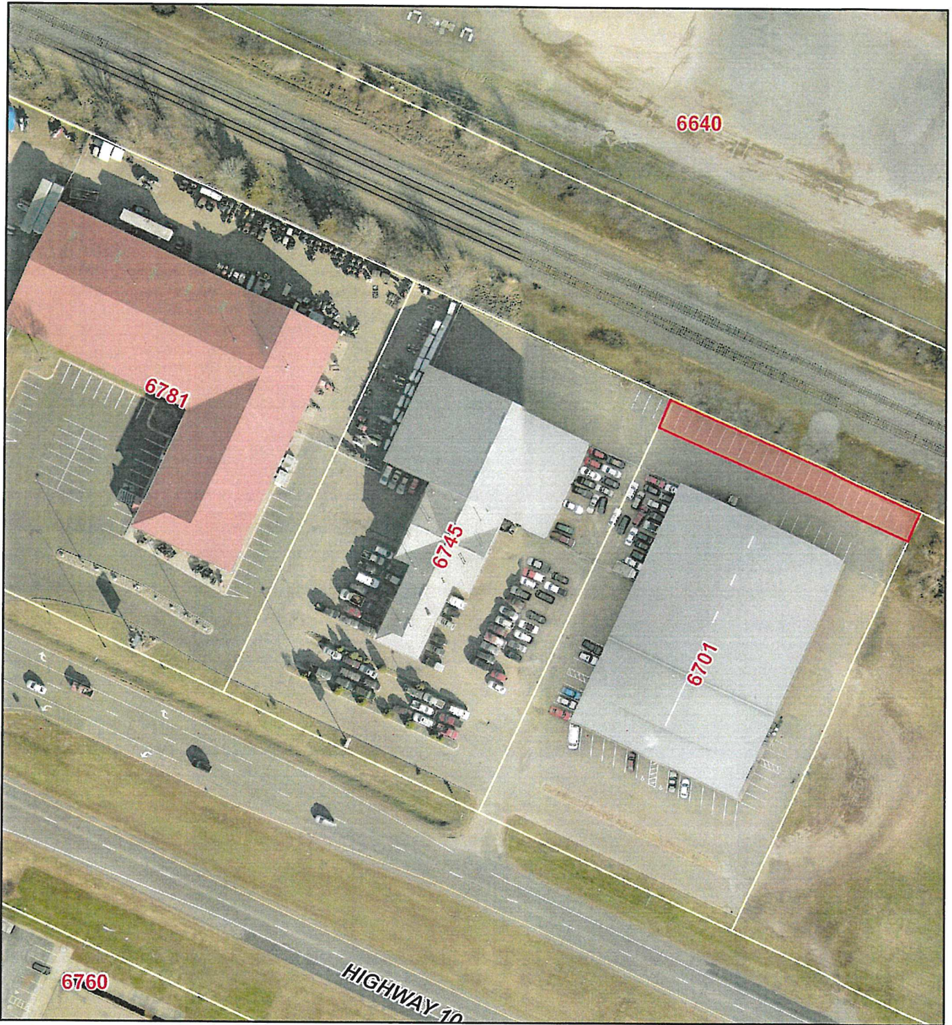
Exhibit A - 6701 Hwy 10 - Temporary Storage Area