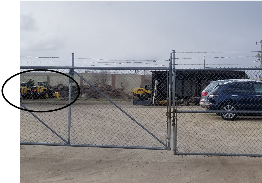
Exhibit 2: Accumulation of junk facing the road